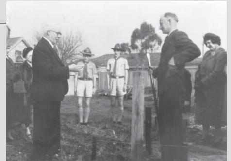
Bedding the first tree stump at 1st Malvern Scout Hall, 1953 Reg No 2159