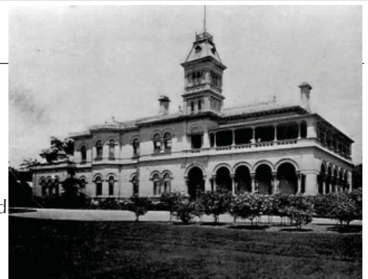
Myoora Toorak 1904 Reg No. 7841