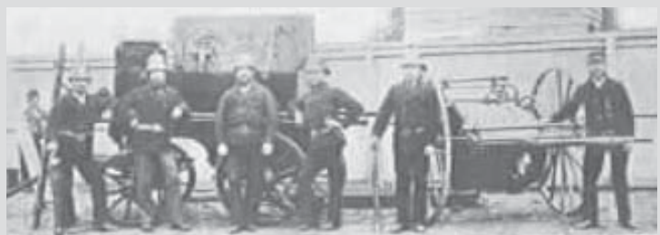
Prahran Fire Brigade 1870's Reg No. 8535

The former Prahran City Fire Station now owned by the City of Stonnington , in Macquarie Street Prahran , the only known station in Melbourne still surviving from the pre-1891 era, has been added to the Victorian Heritage Register .