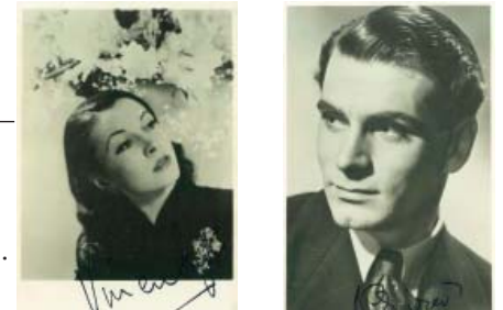
Vivien Leigh and Laurence Olivier 1948

Members - Gold Coin Non-members $5 Delicious afternoon tea!