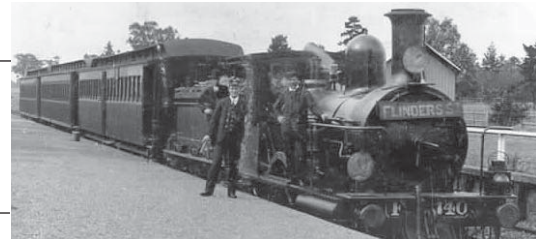
Darling Station 1908 Reg No. 5132

The push-pull steam train featuring locomotives K153 and K190 and W type wooden carriages will operate between Darling and Glen Waverley . Picking up passengers at Darling, Mount Waverley and Glen Waverley. Tickets will be available on the train. Adult - $10; Child u/16 - $5; Family - $25. (Tel: 95448792)