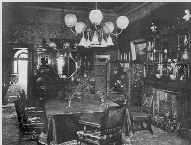
Dining Room 1904 Reg No. 7843

He stood for parliament as a conservative against Alfred Deakin and was elected in 1879. Deakin described him as 'a man of keen intelligence, well-informed on political questions, of strong character, great persistency, marked resoluteness and untiring energy.'