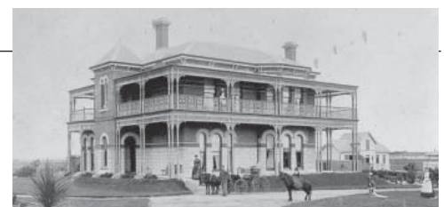
Yallabee 8 Central Park Road c1890 Reg No. 1291