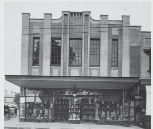
Crittenden's Store in Glenferrie Road on the corner of Edsall Street 1920 Reg No. 13573