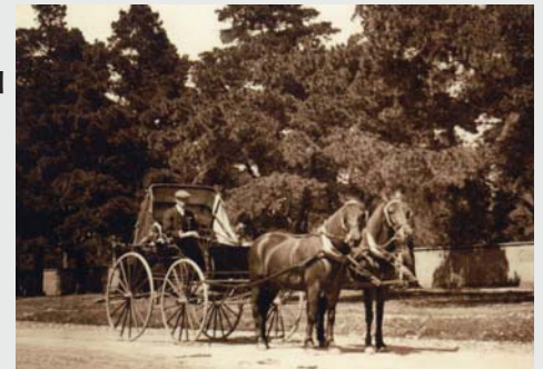
Mathoura Road 1911