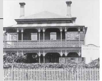
Malvern Business College, Wattletree Road c1920 Reg No: 1639