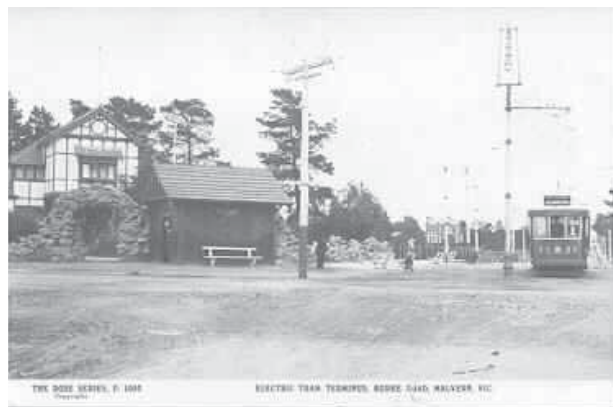
Electric Tram Terminus, Burke Road, Malvern (Rose Series) c1914 Reg no 1363

Reverse of Electric Tram Terminus postcard