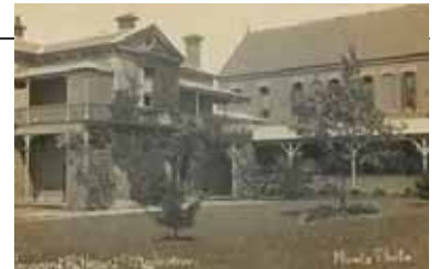
Clifton and Convent of the Sacred Heart, High Street Malvern c.1900 (later Brigidine Convent and Kildara College) Reg No 45