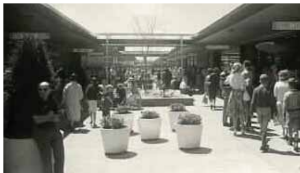
The Mall, Chadstone Shopping Centre (Rose Series) c1960. Reg no 825