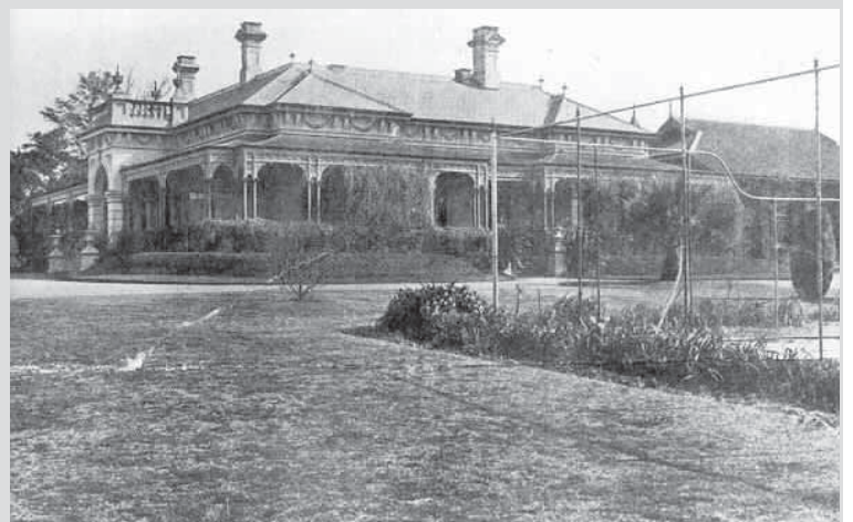
Northbrook High Street Malvern 1929 Reg No 358

The Malvern Historical Society welcomes Council's decision and looks forward to continuing our excellent working relationship with the Stonnington Local History Service .