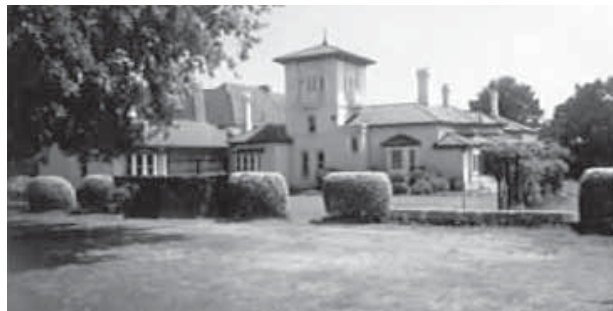
Umina, 13 Lansell Road, Toorak, Country Women's Association. (Rose Series) Undated. Reg no 2482