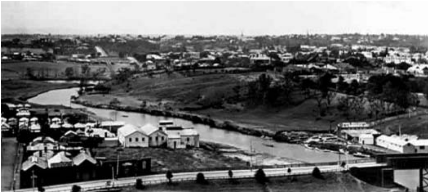
View looking south east from Church Street Richmond, showing the curve of the Yarra (later altered by the construction of Herring Island) c1914