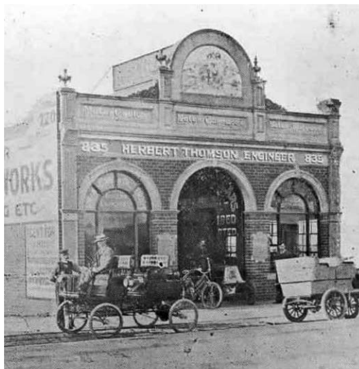
Thomson's Motor Works in High Street, Armadale 1906