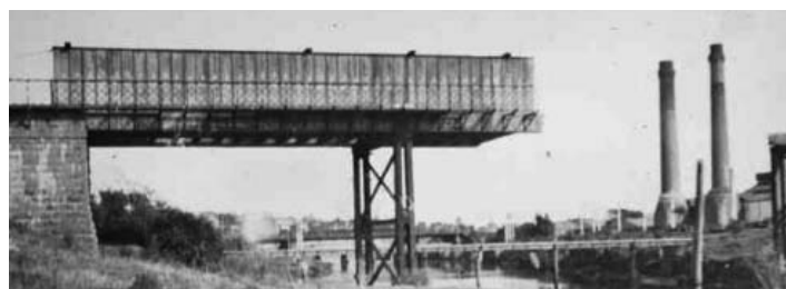
Dismantling the first Church Street Bridge 1921

Work is progressing on repairing existing Heritage Markers and replacing the ones that have gone missing! The Council has set aside funds in the budget to undertake this important catch-up work so that new markers can be commissioned in the coming year. The first to be installed within the next twelve months include the Stonnington City Centre (Malvern Town Hall), Mandeville Hall, Prahran Council, Church Street Bridge, Malvern City Square, Malvern Council, the Malvern Hill Hotel, Prahran Mechanics Institute, and Holy Trinity Church.