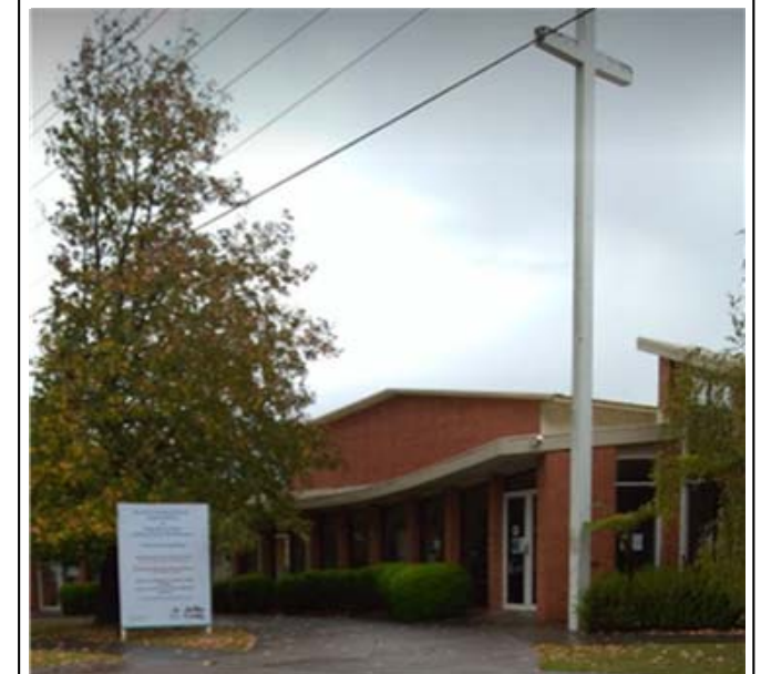
St Johns Church, Virginia Street - Mt Waverley

As 21 st century people interested in history, we do well to keep an eye on remnant vegetation areas and any other indicators of the original climate, to recognise the changes in the Wurrundjeri seasons and appreciate the knowledge accumulated over thousands of years.