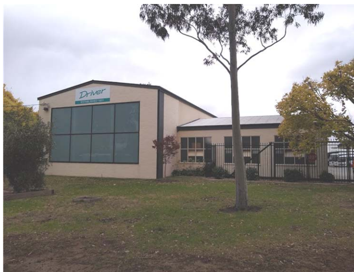
Driver Buslines Headquarters Mount Waverley