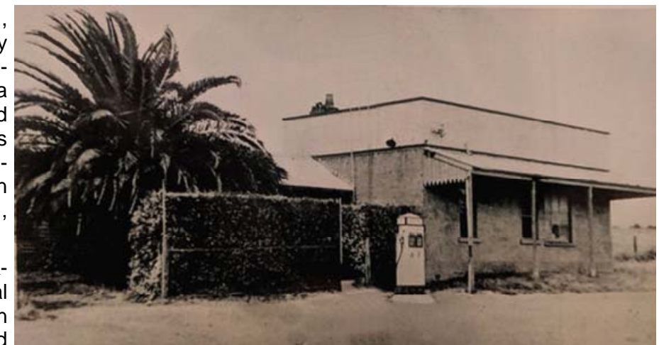
Kirks premises on the NW Corner of Dandenong Rd and Clayton Rd