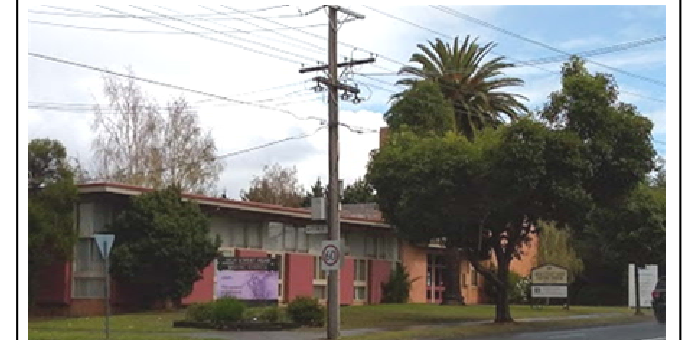
High Street Rd Church - Mt Waverley

According to the 1987 centennial history of High Street Rd Uniting Church, "One in Christ" by Margaret Turnbull, the tall palm tree outside the front door was planted in 1917, so is over a century old.