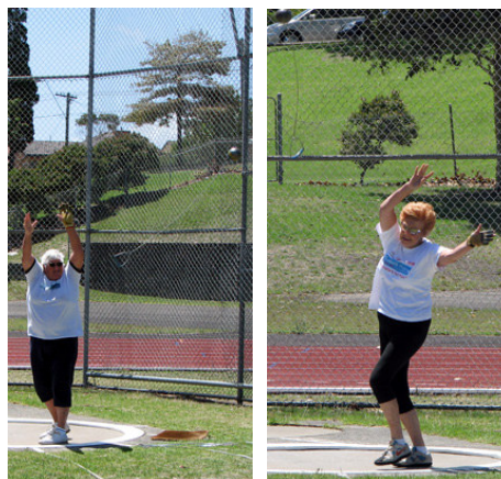
Hammer in the sunshine on Jan 28, 2007