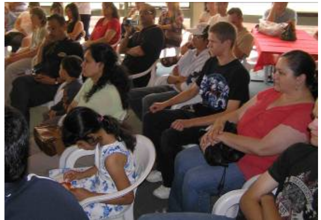
Parents and children at the presentation day