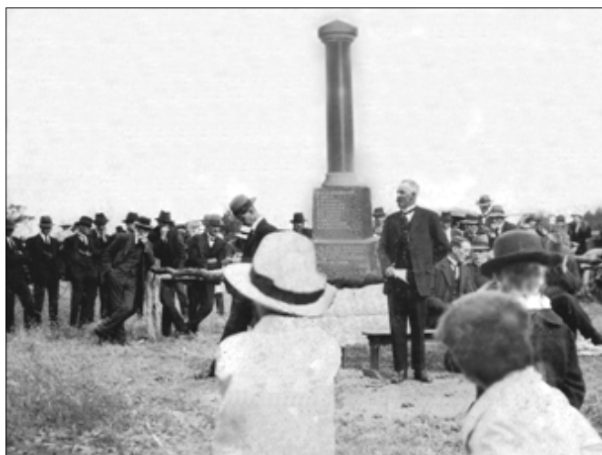
Marungi Memorial Opening 1921

November 20 2021 marked 100 years since the opening of a War Memorial in the small village of Marungi, 20 km North of Shepparton.