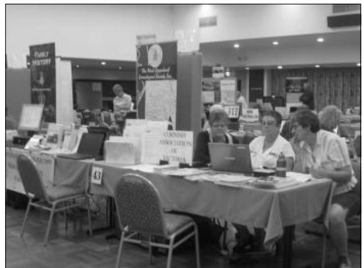
Deniliquin Family History Expo Participants