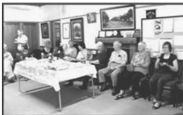
Afternoon tea 30 years on.

The article and photographs included in this newsletter (p 5-7) show just some of the many members who have contributed to our success and also the improvement in facilities and resources over the years. We are indebted to “ The Shepparton News ” for the many stories and photographs they have printed giving us some extremely valuable publicity for upcoming events, achievements or books we have had published.