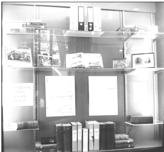
Display at the Goulburn Valley Regional Library