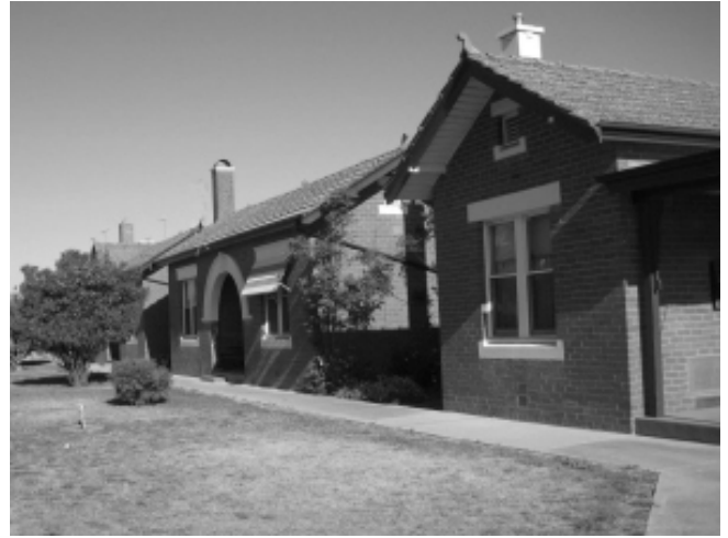
Shepparton's Miller Homes