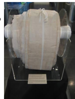
The 260 metres long 1891 suffrage petition.

By 1905 all women*, except Victorian, were given the right to vote in state elections. Women* had been given federal suffrage in 1902, Australia being the first major country in the world to give women the right to vote and stand in federal elections. Victorian women* had to wait until November 1908 for the Adult Suffrage bill to be passed granting them equal voting rights with men.