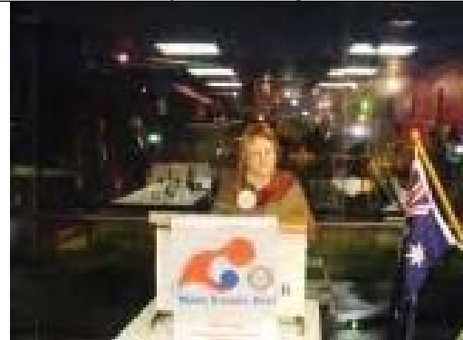
Marg calling for order