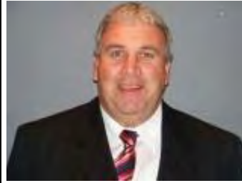
The presidents portrait