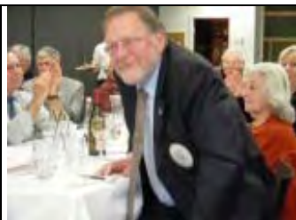
If I had known I would have had a haircut