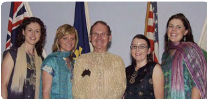
The Dream Team has returned from their GSE tour of District 2980 in India. The Rotary Club of Frankston North gave them the well deserved welcome home dinner on Saturday. Their tour has been a resounding success and we look forward to seeing their presentation at the 50th District Conference later this month.

Deadline for copy is the 5th day of the month