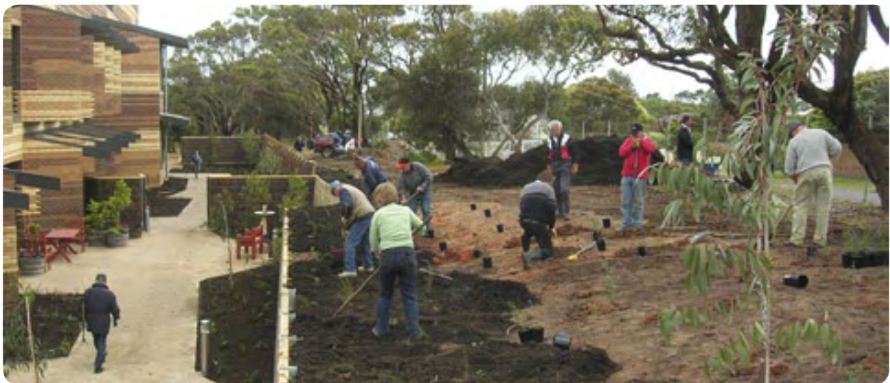
Rotary club members work on the new gardens at The Mornington Centre.