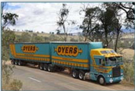
One of 10 – 12 B-Doubles operated by Dyers