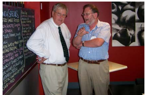
Two engineers discuss the Sundermann turbine

Fred said his turbine could be permanently fixed in waterways, rivers as well as farm irrigation channels, or in the ocean mounted on anchored floats. Test results have confirmed the forecasted operating characteristics (shaft rotational speed, torque and power output) The prototype unit, as currently designed, with a blade area of 0.5 sq. m., has shown itself capable of producing 1kW of power when placed in an irrigation channel with water flowing at a speed of 1.8 metres per second. This is significantly higher than the expected power output on any similar existing paddle type turbine.