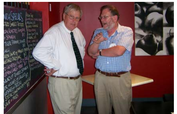
Two engineers discuss the Sundermann turbine