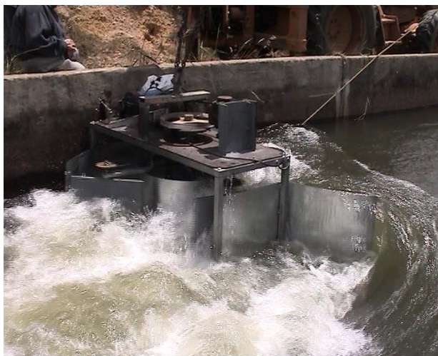
Testing the Sundermann turbine in an irrigation channel