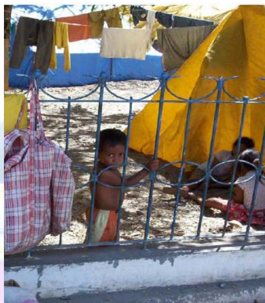
Life in Dili: Children from some of the families displaced by the civil unrest in East Timor.

The ShelterBox team also delivered 115 of the boxes to camps set up by the Ryder-Cheshire Foundation in an area about 20 minutes drive away from Dili. Darren added: "A number of the people were from Dili and have moved away to the safety of this area."