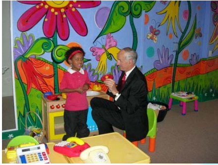
Boyd visits Nambour, Australia, in August 2005