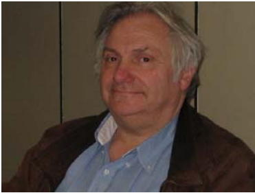
Our other pharmacist!