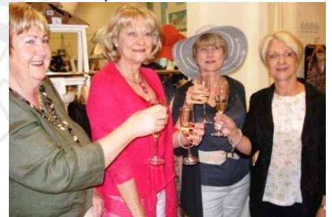
Well done ladies!

Last week Pres Anne indicated that the evening raised $558 for the for Borroondara Cares (and some new outfits for our ladies).