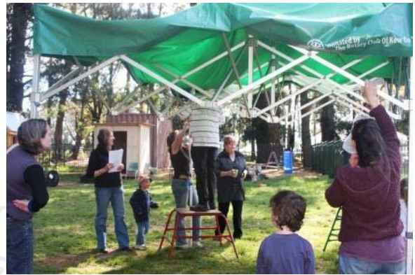
Putting up the Marquee