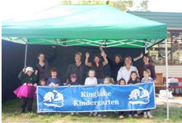
Kinglake Kindergarten gets it's Marquee and Banner

Rotary and the Kinder are also working on a new BBQ and other projects.