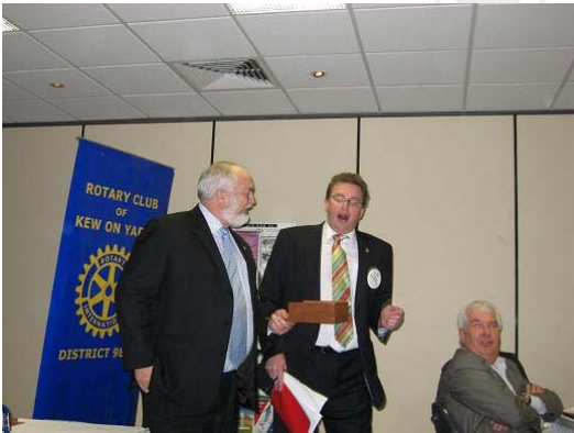
Hooray for the Sergeant