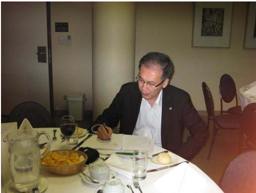
The Editor at work