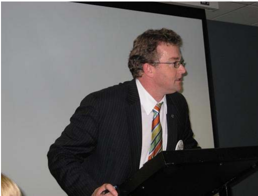
The Sergeant hard at work