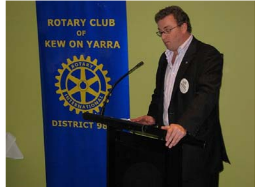
The sergeant at work.