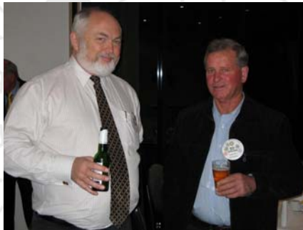
I love my beer!