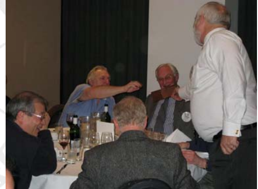
The hard working corporal