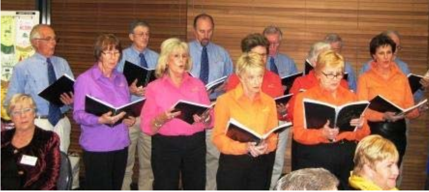
The Sing Australia Hawthorn Choir