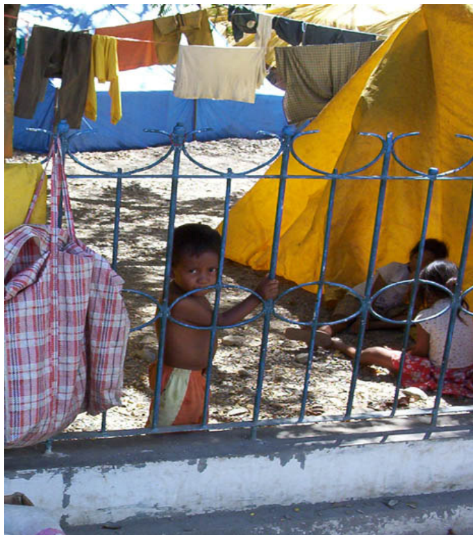
Life in Dili: Children from some of the families displaced by the civil unrest in East Timor.

Although a 2,500-strong international peace-keeping force has since been deployed, many families have been displaced by the violence and still do not feel safe to return to their homes.