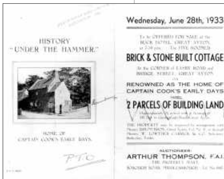
'History Under the Hammer,' 1934