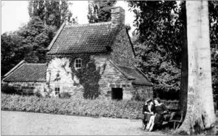
Captain Cook's Cottage, 1939