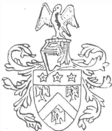
Arms of ALDOUS of FRESSINGFIELD

Recently while travelling to Yackandandah to a felt making weekend I decided to travel via Jamieson as I had heard that there was some family information there. The secretary of the Jamieson Historical Society arranged to meet me at the museum as it was outside their normal opening hours. When I arrived she had the folders of the various families I had mentioned ready for me and some cemetery information already printed out. I selected lots of material for photocopying but didn't have time to really look at it until I arrived home on the following Tuesday.