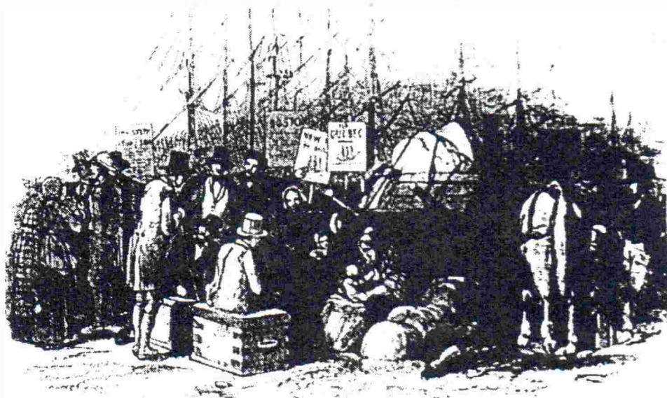
Irish Emigrants at Cork Illustrated London News , May 10, 1851