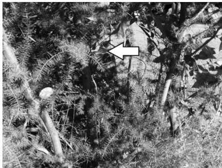
Spot the headstone?

The new CDROM "Photo Transcription Index of Narracan Cemetery Headstones, 2010" will sell at $20 and is due for release in August. Included on the CD will be an Index of names linked to the photograph of the headstone. Expressions of interest can be mailed to "The Secretary", details on the front page.