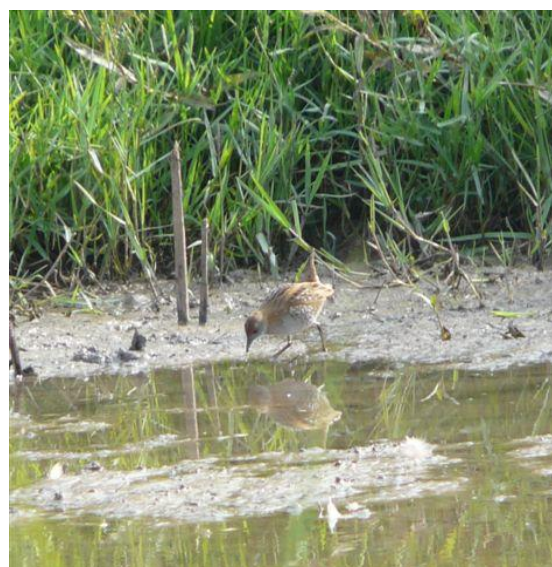
Baillon's Crake, Mansfield (Anne Finlay)

Undoubted highlight for the day was a single Baillon's Crake feeding in shallow water in front of a reed bed. The bird was on view for at least 5 minutes, while we checked it against our field guides. We were also fortunate to obtain good views of a Little Grassbird.