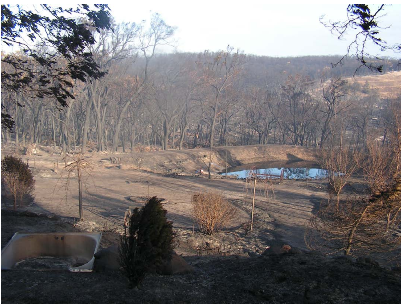
[This photo is courtesy of Kaye O'Reilly from Churchill.