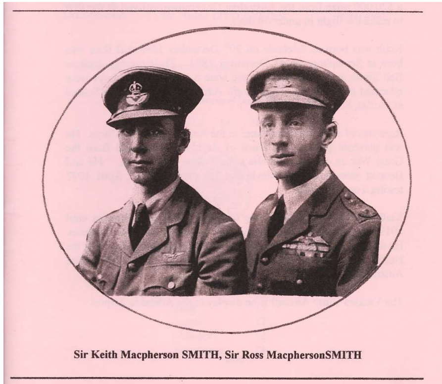
Sir Keith Macpherson SMITH, Sir Ross Macpherson SMITH

[From The 2008 Scottish Datebook & Directory published by The Scottish Associations of South Australia Inc, comes the following item of possible interest to the "Bell" families. Ed]