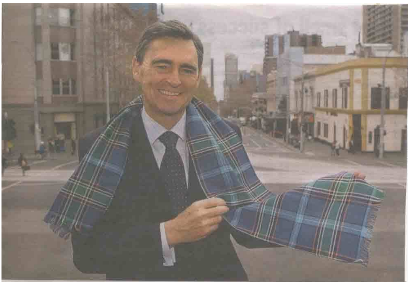
Tartan up the state: Premier John Brumby models the state's new tartan.