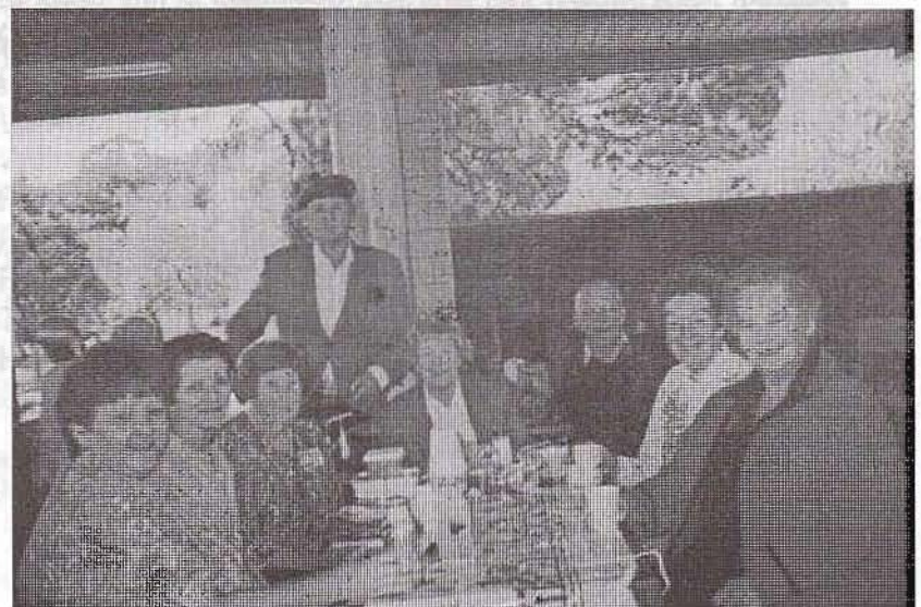
Members enjoying the picnic at Geelong, February 2003