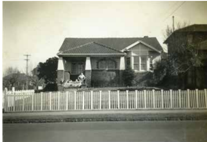
165 Tooronga Road Malvern c1950

My parents married during World War II and, for a time, lived with the extended family in Caulfield. I was born in 1947 and my brother in 1949, and my grandmother decided that we would all move back into the Tooronga Road house. When we moved in, there was a Cyprus tree hedge around the front and side of the house. It had to go and one of my father's first jobs was to cut down and uproot the hedge, replacing it with the picket fence shown in the photograph. My sister, Beverley, was born in 1952.