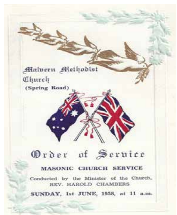
Order of Service, Masonic Church Service 1 June 1958