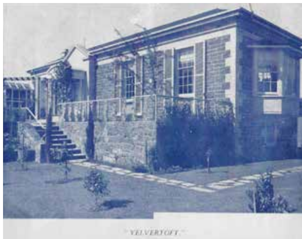
Yelvertoft, 58 Caroline Street South Yarra 1938