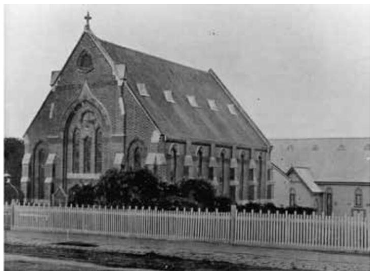
Malvern Methodist Church (Spring Road) c1910