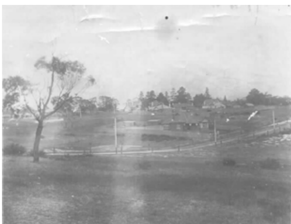
Glenbrook Avenue Malvern East 1913