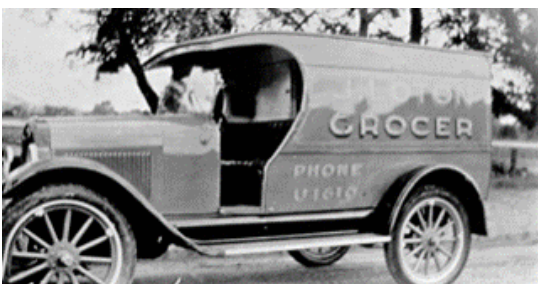
Loton's grocers truck (undated)