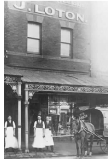
ABOVE RIGHT: Loton's Grocery Store, Malvern c1920