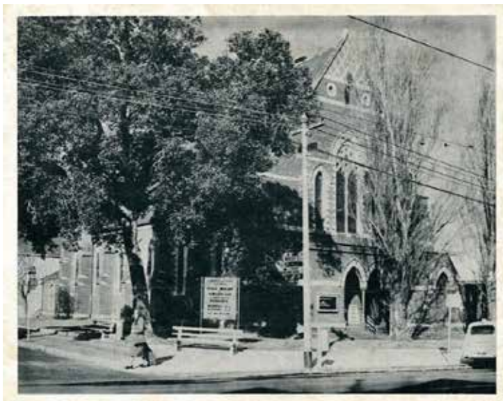
Malvern Congregational Church, Glenferrie Road Malvern c1960

In 1885, land for a church was purchased in Glenferrie Road on the south corner of Winter Street. The memorial stone was laid in 1886. The new church was built to the design of architects, Billing & Son. A second foundation stone was laid when the building was extended in 1889. The Malvern Congregational Church was demolished in 1966 to make way for Coles New World Supermarket.