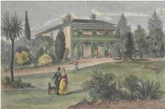
Armadale House, Armadale c1887