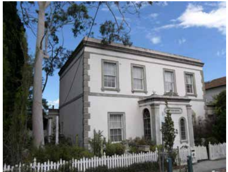
50-52 Albion Street South Yarra 2017 Stonnington History Centre SH70282

50-52 Albion Street, erected c1871, stands on the corner of Albion and Tyrone streets, with garden setbacks to the front and east side. In 1868 the land was owned by carpenter Edwin Samuel Giles Litchfield, who owned several properties in the area. Litchfield was rated for a 4-roomed timber house (in progress) in 1871, which appears to refer to the beginnings of 50-52 Albion Street. By 1873, Litchfield was rated £46 each for no. 30 and no. 32 Albion Street, for brick and timber houses of 7 rooms each. In 1874, one of the dwellings was referred to as Clifton in The Age when a furniture sale was held by William Dickson of 32 Albion Street. In 1879, William Watkins was rated £40 each for two 7-roomed brick and timber houses at 30 and 32 Albion Street. The numbering in Albion Street changed in 1891 from 30 and 32 to 50 and 52. At the time, the houses were owned by Emma Watkins. The two houses were being used as a single dwelling when they were offered for sale in November 1975. At some period in the 20th Century, the property was a boarding house.