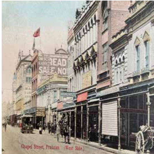
ABOVE LEFT: West side of Chapel Street Prahran c1906