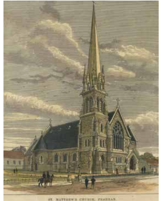
Hand-coloured engraving of St Matthew's Church, 157a High Street, Prahran c1878

At 1 o'clock in the afternoon, the Bishop of Melbourne (Dr Moorhouse) and a large number of the clergy assembled in the School room, and, preceded by the trustees and the church building committee, walked in procession to the new building.