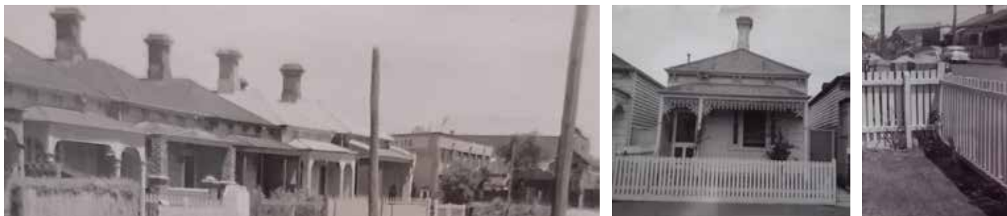
Howson Street, Armadale (Images: c1965)