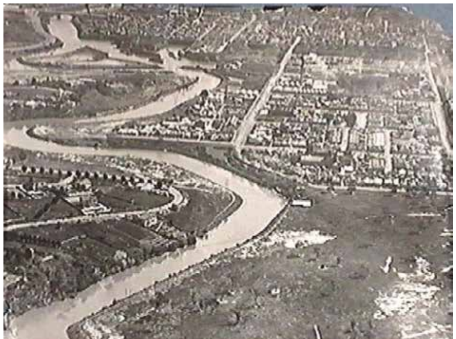
Aerial view of Yarra River, looking west from around St George's Road/Heyington c1931. Stonnington History Collection PH6001.1

Nearby, the MacRobertson Bridge was built in 1934, although a bridge at Grange Road was proposed as early as 1884.