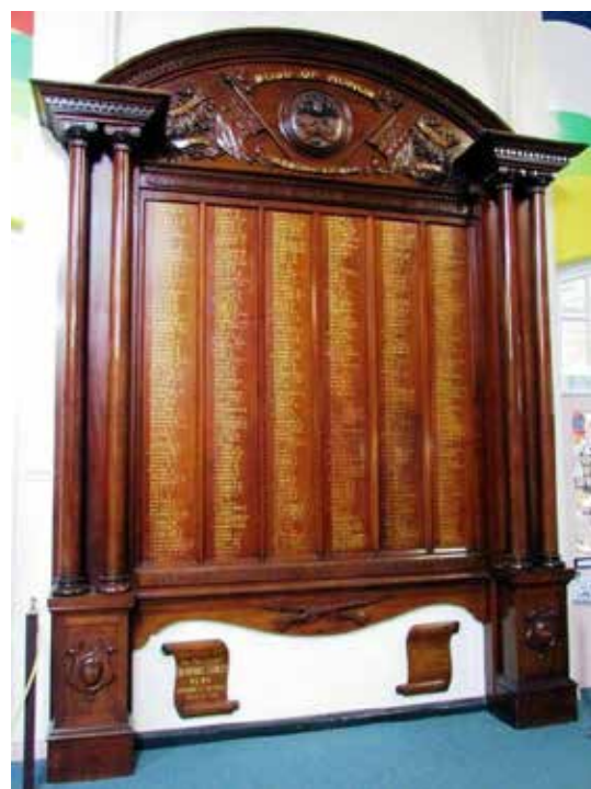
Tooronga Road State School Roll of Honour