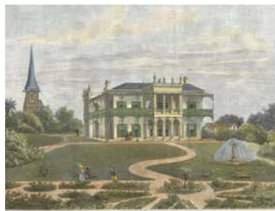
Hand-coloured engraving of Leura , Toorak - The Residence of the Hon R Simson c1887 (George Alphonse Collingridge de Tourcey)

https://www.daa0.org.au/bio/george-collingridge/biography/