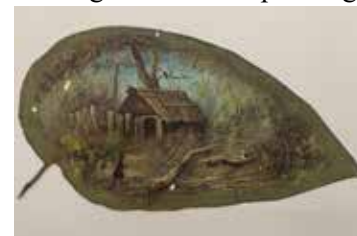
Painted Gumleaf Stonnington History Collection SHC71285.1