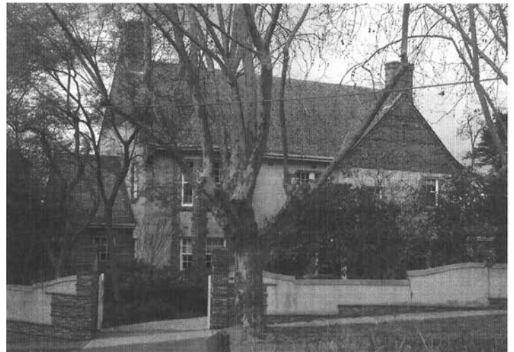
28 Albany Road, Toorak (undated)