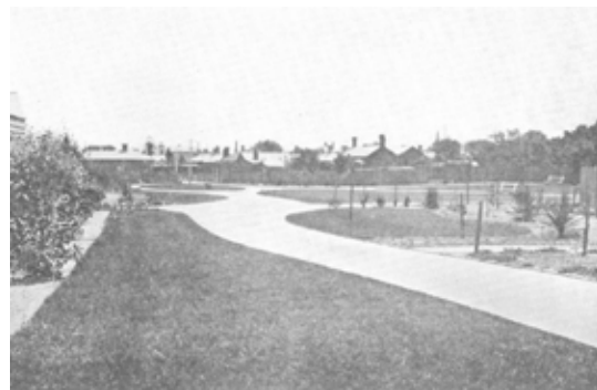
Gladstone Park, Windsor c1913 Stonnington History Collection PH9171

In 2022 the Windsor Siding BMX track, 104 Union Street, Windsor, was redesigned to make it safer and more accessible to users of all abilities. Since its opening in late 2016, the BMX track has been popular with families and BMX enthusiasts. Over the years the track surface has deteriorated. The new surface will be smooth bitumen, creating a multi-sport facility for BMX, skateboarding and scooters. In 1985 there was a BMX in the former City of Stonnington, on the site of the future South Eastern Arterial Road link, close to Gardiners Creek.