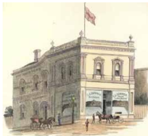
Hand-coloured drawing of the offices of C.E. Connop, architect, corner of Commercial Road and Balmoral Street, Prahran c1890 PH9027