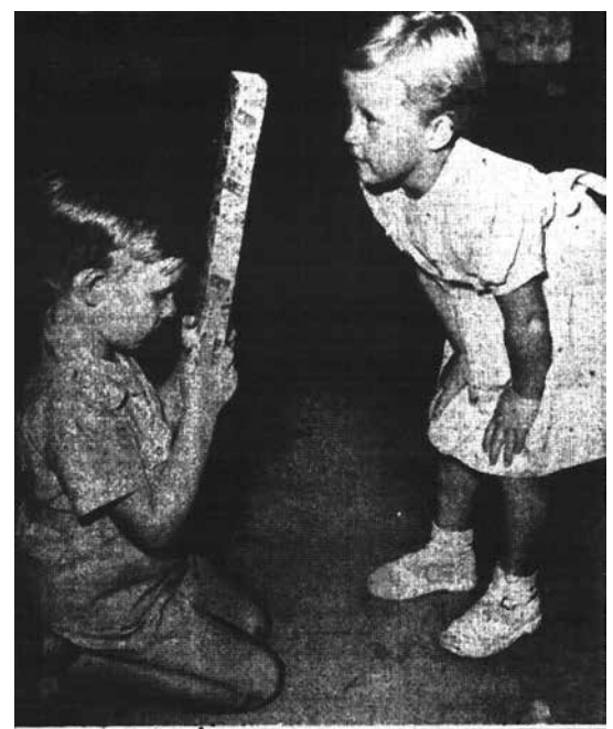
Undated newspaper cuttings.