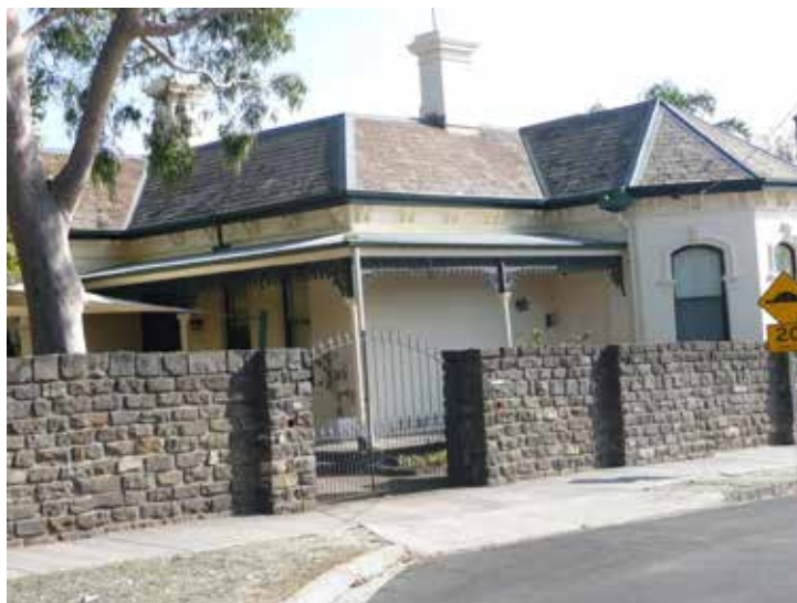
555 Dandenong Road Armadale c1995