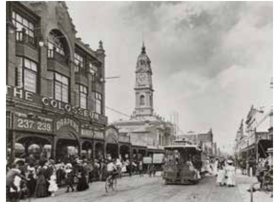
Looking north along Chapel Street c1911 Stonnington History Collection PH7077

Analyzing Australian History co-edited with Ashley Pratt (2021) www.cambridge.edu.au/education