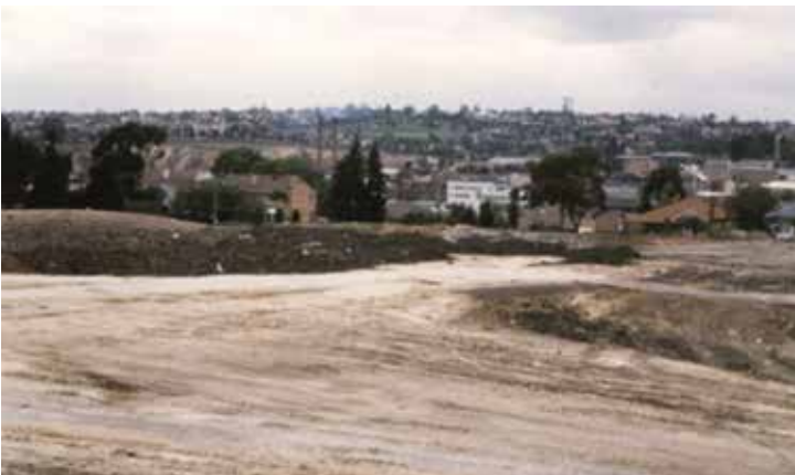
Toorak Tip, corner Elizabeth Street and Toorak Road Malvern

Land for a brickworks and associated quarry in Elizabeth Street, Malvern, was purchased by the City Brick Works Company Pty Ltd around 1902. It was used as a clay pit for some years. In 1907 the clay hole extended to a point halfway across to where Henderson Avenue is today. Quarrying was discontinued in the early 1950s. In 1956 Malvern Council rented the area as a tip site and the quarry was slowly filled over the next decade. In 1968, the land was purchased by the MMBW and in 1973 it was transferred to Malvern Council in compensation for land lost in the building of the South-Eastern Freeway. In 1974 Sir Robert Menzies Reserve was opened on the site of the quarry, but the brickworks were still operating in 1980. Around 1984, the brickworks site was re-zoned residential, the brickworks were demolished and by 1986 the land facing Elizabeth Street had been subdivided into housing allotments and sold.