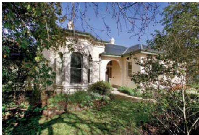
186-188 Wattletree Road Malvern