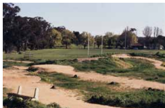
City of Malvern BMX track 1985 Stonnington History Collection MP14648