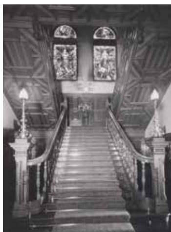
Stonington central stairway c1940 SHC71285.6