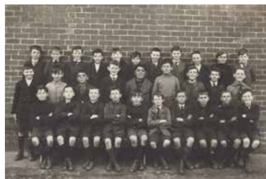
University College, Armadale