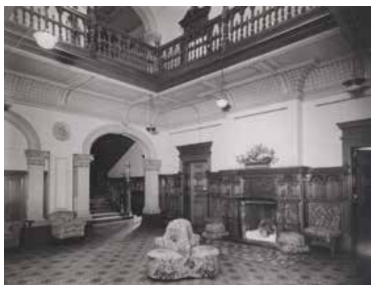
Stonington c1940