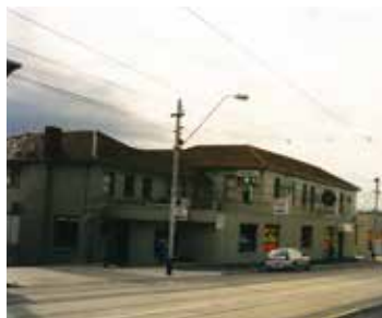
Malvern Vale Hotel, 1321 Malvern Road, Malvern c1980 (Brown family)

The original weatherboard single-storey Turf Club Hotel was built in 1871 in Dandenong Road, opposite the entrance to Caulfield Racecourse. John Heywood, a prominent racing personality, was the hotel's publican until the turn of the century. In 1879 the railway line severed the direct route from the racecourse to the hotel. Around 1923 the timber hotel was replaced by a two-storey brick building. Dan Murphy's took over the hotel in 1994 and the building was later demolished.