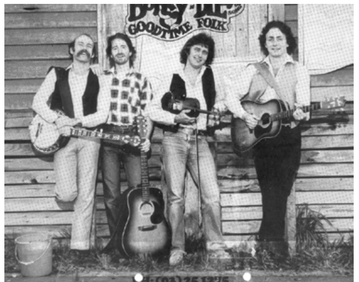
Bobsy-Die Goodtime Folk outside the Marvel's Potato Factory, near Moira Street Glen Iris c1980

If you have material relating to Victoria please contact the RHSV collections@historyvictoria.org.au or message them on Facebook.