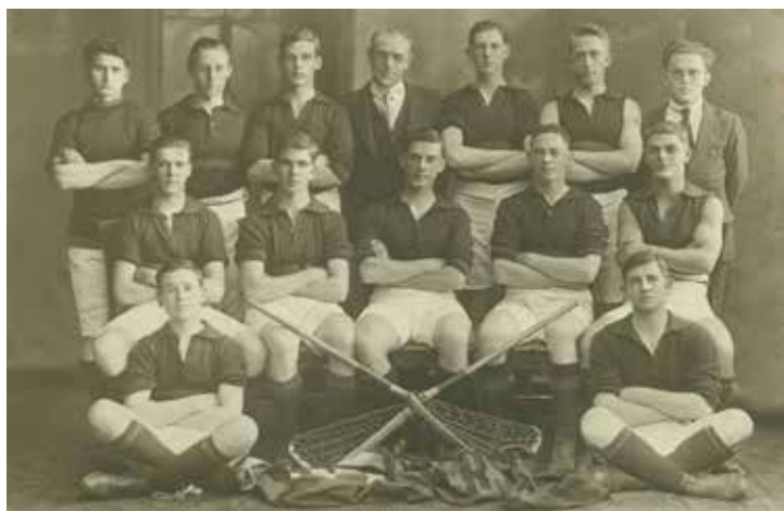
Malvern Lacrosse team (undated)

Did you know that over half of the sports featured at the Commonwealth Games are played in Stonnington? The local sports clubs can be found on the Active Stonnington website. www.stonnington.vic.gov.au/active/Home