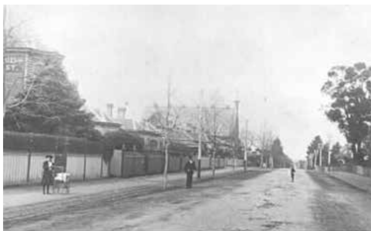
Malvern Presbyterian Church, Wattletree Road, Malvern c1900 Stonnington History Collection MP1244