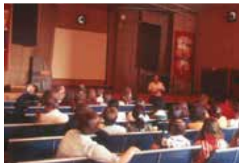
Mercer House assembly 1970 (Image: Thomas E Meier) Stonnington History Collection MH71203