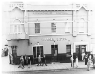
Armadale Hotel c1950 Stonnington History Collection MP2236