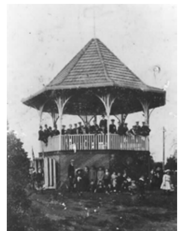
Bandstand (rotunda) at the Malvern Cricket Ground, High Street, Malvern 1910. Stonnington History Collection MP1023

https://bandblastsfromthepast.blog/2022/07/31/a-band-a-council-correspondence-and-financial-records-a-case-study-of-the-malvern-city-band/L