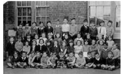
Preparatory Grade, Windsor Primary School 1940