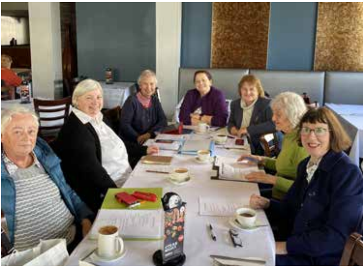
Malvern Historical Society Committee November 2022