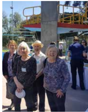
MHS members welcome the return of the Harold Holt Swim Centre dive pool, October 2022