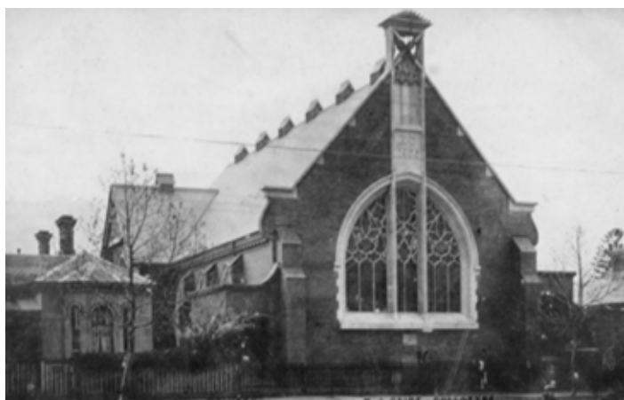
Presbyterian Church Malvern c1910

The Malvern Presbyterian Church collection has been added to the Stonnington History Collection.