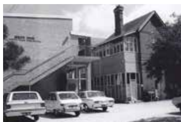
Mercer House (Associated Teachers Training Institution), Mercer Road Malvern