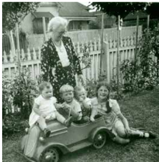
Priddle Family c1940 MP250