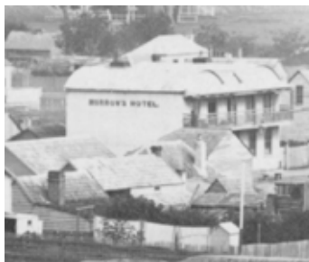
Morrow's Family Hotel 1867 Stonnington History Collection PH60949