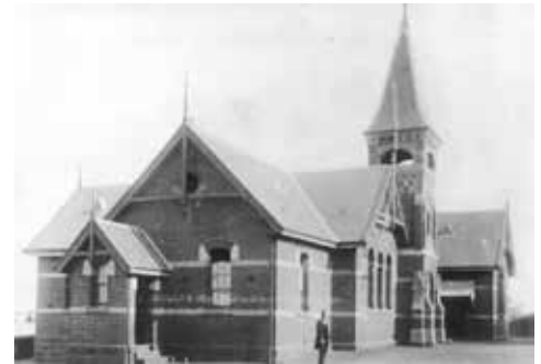
Spring Road School Malvern 1890 Stonnington History Collection MP2622