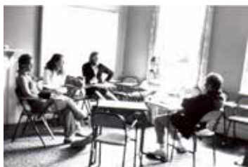
Mercer House tutorial 1971