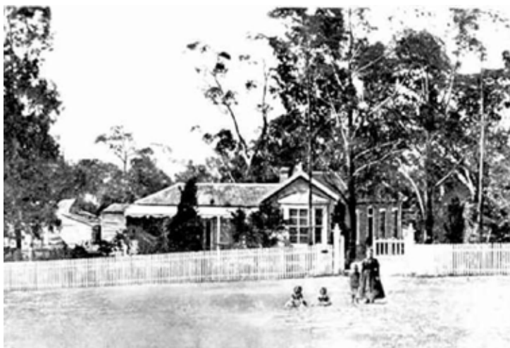
Early Toorak and District E.M. Robb, Melbourne: Robertson & Mullens.