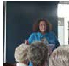
Committee members enjoying the morning!