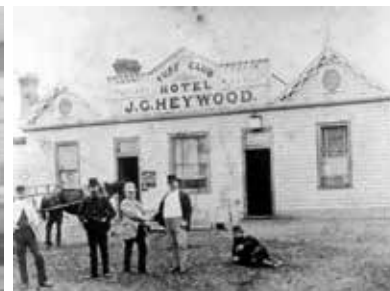
Turf Club Hotel, Dandenong Road East Malvern 1880 MP5212