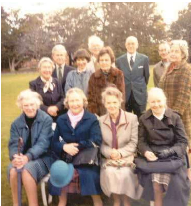
Celebrating the planting of the Malvern Historical Society's 10th Anniversary rose garden, Malvern Gardens 1982.