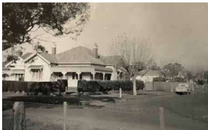
140 Milton Parade Glen Iris (undated)