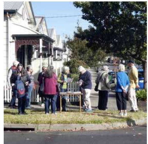
Armadale Street Armadale Walk April 2022