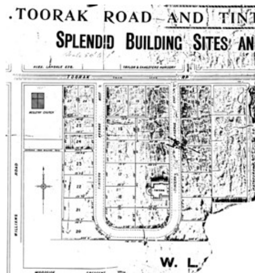
Land subdivision - Tintern Estate (undated) Stonnington History Collection PH11236

The Melbourne Metropolitan Board of Works plan 972 for 1898 shows the exact footprint of the house and outbuildings on the property, prior to subdivision. The property contained stables, piggery, cow shed, dog and fowl yards, with acreage under grass. The driveway entered the estate from Toorak Road and an extensive garden surrounded the house where pathways meandered through an orchard and trellised fernery.