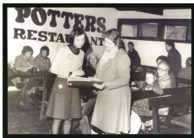
Malvern Historical Society visit to Potters Cottage Eltham c1973