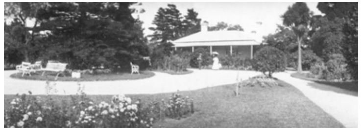
Haverbrack Glenferrie Road Malvern 1904 MP14067