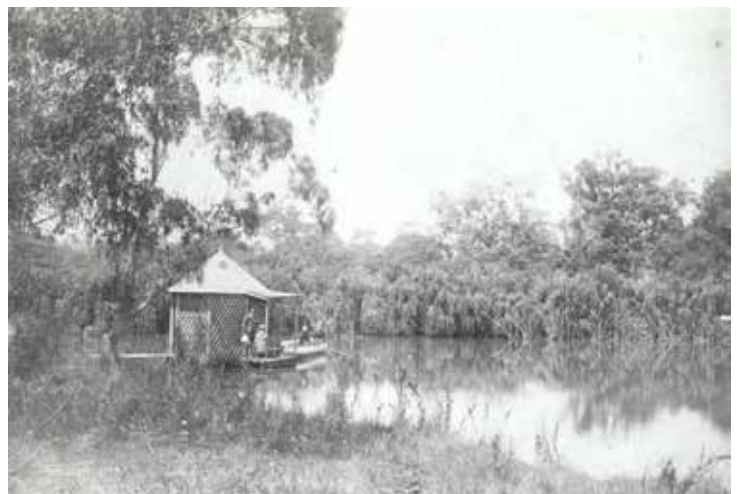
Lake and pavilion at Hedgeley Dene Farm 1880s Stonnington History Collection MP7344