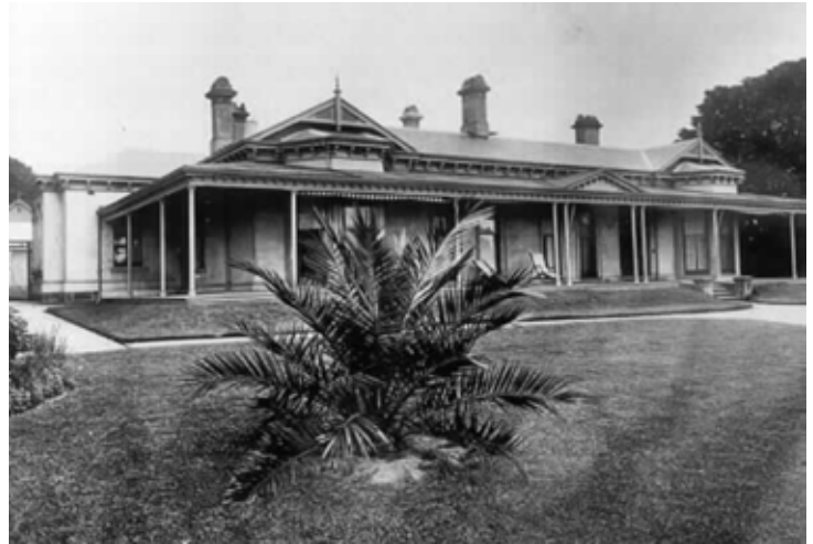
Kinnoull Sorrett Avenue Malvern c1950

Earlier I mentioned that we lived in Spring Road. Ours was the first house built on the subdivided land extending to Ascot Avenue to which the northern boundary of the Malvern Gardens fronted. Our cow, Strawberry, used to graze on the land fenced in by a three wire fence. Lady Carmichael, the wife of Sir Thomas Carmichael, the Governor, used to walk their children and the nanny to the Malvern Gardens taking a short cut through the paddock. Strawberry was usually very docile but on one occasion took exception to the red parasol Lady Carmichael was carrying and decided to show her annoyance by