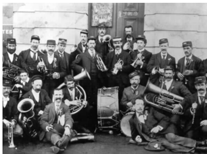
Malvern Brass Band c1910 MP221

This presentation will show a short history of the band movement in Victoria including notable developments and events in the Victorian band movement. The presentation will also focus on the local area and the many intricacies and little stories surrounding the bands in the City of Stonnington.