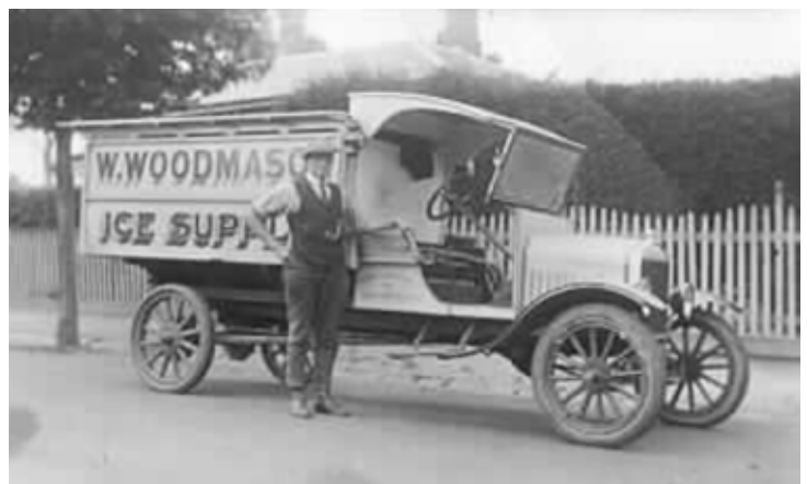
W. Woodmason, Ice Supply Glenferrie Road Malvern. c1923 Stonnington History Collection MP1316