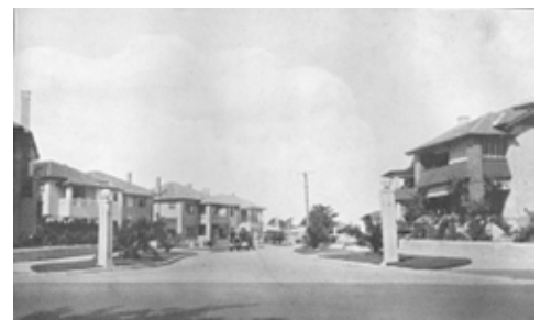
Linden Court c1930 PH12968