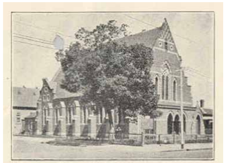
Congregational Church Malvern 1942 MP14071