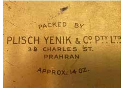
Top and above: Plisch's Bakery Prahran biscuit tin