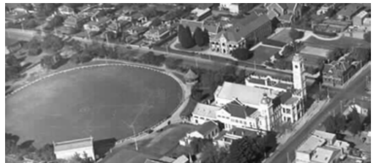
Malvern Town Hall c1926 Stonnington History Collection MP5101

stall wooden lockup. Behind the Police Station, where the car