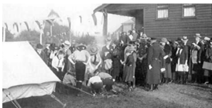
Opening of new Toorak scout hall 1922 Stonnington History Collection PH9329

Scout Heritage Victoria's collection provides an insight into the history of Scouting in Victoria. The Scout Heritage Victoria Adventure Centre allows youth members and adults to explore fun interactive activities relating to a range of themes from past and present Scouting eras. 62A Mackie Road, East Bentleigh.