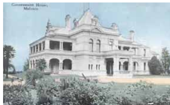
Stonnington, Government House Malvern c1910