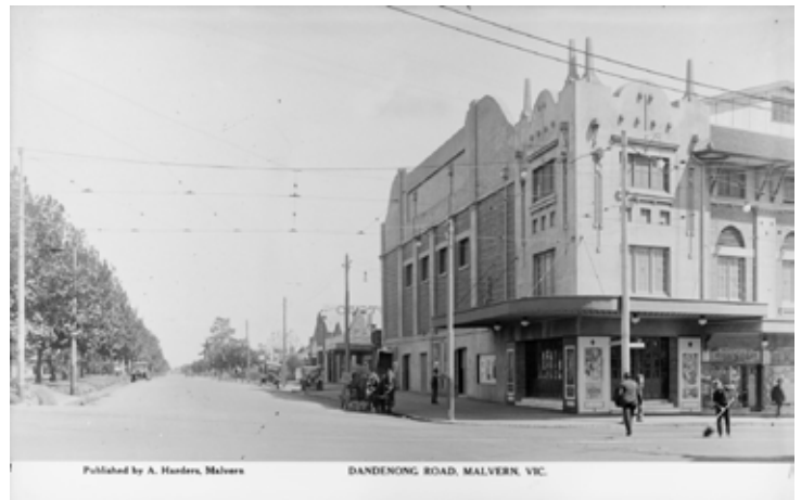
Scanned glass plate negative of Dandenong Road, Malvern (undated)