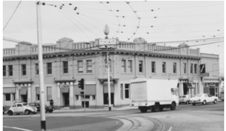
Angel Hotel 641 Dandenong Road corner Glenferrie Road Malvern 1984. Stonnington History Collection MP924

In 1857 the Surveyor General set aside Crown Allotment 20 on the Malvern Hill (north east corner of Glenferrie Road and High Street) for public purposes generally. Eventually the land was subdivided into smaller allotments and in 1878 the Governor in Council, by order, proclaimed a site for a Shire Hall, Court House, Public Library and land adjoining for a Police Station, recreation ground and site for a Wesleyan Church and a Church of England. In 1884 the Council determined to build the Shire Hall and decided to float a loan of £5000 for its cost as the Court House was to be included. The council anticipated a contribution of about £2000 from the Government and accepted a tender of £7500 for the construction of a hall to seat 400, a Court House Magistrates Room and for a Clerk Of Petty Session, a library 25 x 18 feet and a room 12 x 12 feet for the Shire Secretary. The building extended to about two thirds of the present frontage to Glenferrie Road with the tower reaching 4 storeys. In 1890 extensions were made to the building - the tower was built higher, the clock added and