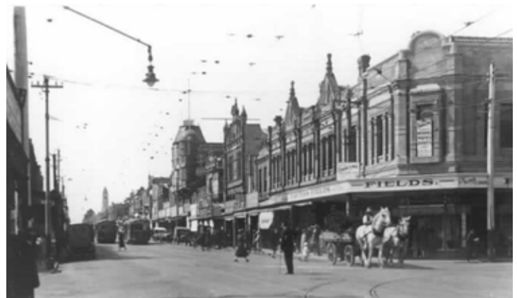
Corner of Glenferrie Road and Wattletree Road Malvern looking north. The Tivoli Theatre is the large building with a tower. c1920 Stonnington History Centre MP5141