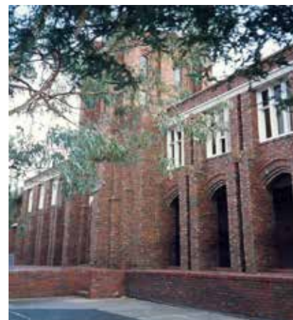
Tower Building, De La Salle College 1992 Stonnington History Collection MP7979