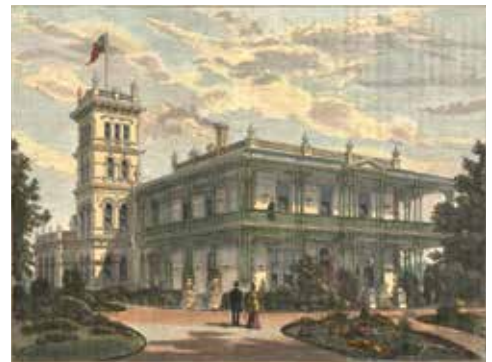
Illustration of Linden c1970s It is a hand-coloured copy of an illustration which appeared in Victoria & Its Metropolis