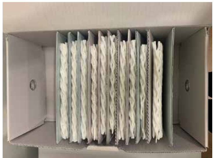
Safe storage for glass plate negatives