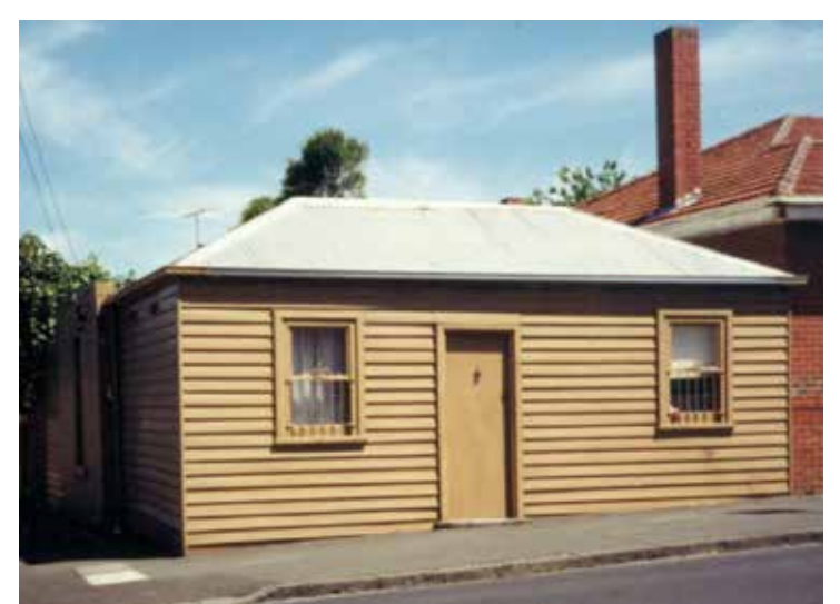
5 George Street Prahran 1993 Stonnington History Collection PH61893 (also on Victorian Heritage Database)

A Heritage Overlay is a planning scheme control contained within the Stonnington Planning Scheme (Clause 43.01).