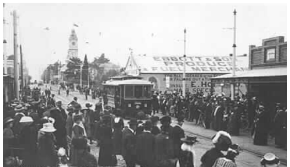
Watching the first tram in Glenferrie Road Malvern 30 May 1910 Stonnington History Collection MP1247

https://www.nfsa.gov.au/collection/ curated/opening-prahran-malverntramway-1910