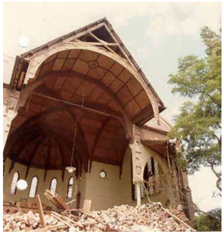
Unauthorised demolition of Wesleyan Methodist Church c1985 to 1986 Stonnington History Collection PH10189.11

'A dramatically-sited polychrome brick church, with stone details, designed by Percy Oakden and built in 1887, comprising a hexagonal preaching space, crowned by a wooden fleche, and aspidal termination sited above and undercroft. The nave was intended to be longer. This building is notable for its powerful use of brickwork, vertical proportions, simplified details and amphitheatrical interior. The building was illegally part-demolished in November 1985. Classified: 30/04/1981'