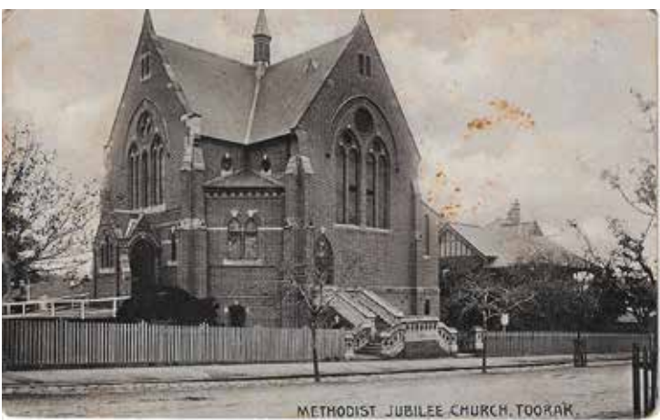
Methodist Jubilee Church postcard (undated)