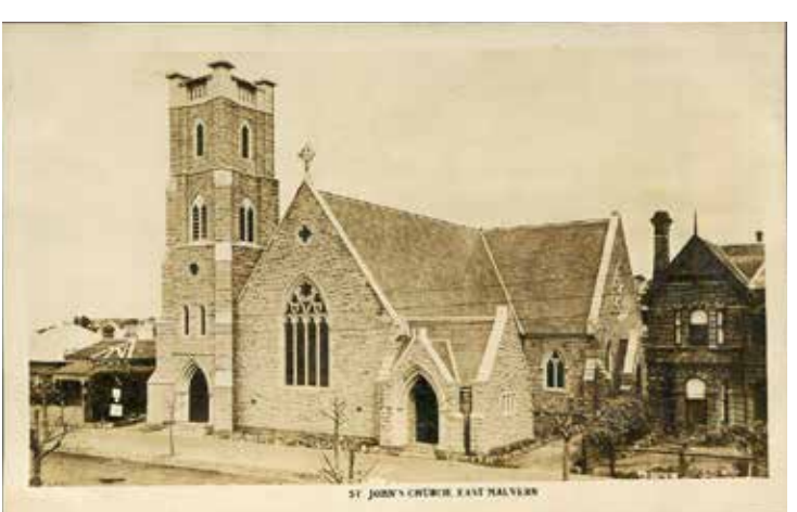
During the early part of the twentieth century the church congregation rapidly expanded. A branch Sunday School and a mission church (now All Saints Malvern East) were established, and plans were made for a larger church on the Finch Street site. On Wednesday 14 April, 1920, the last services in the original brick church were held. For the next two and a half years, while the new church was being built, services were held in the parish hall. On 16 December, 1922, the present church, incorporating much of the material from the older building, was consecrated as a Peace Memorial Church. An unusual feature of the ground plan is that the chancel is at the west end of the church, the reverse of the traditional position. www.saintjohns.org.au

The first St John's, a timber church, was opened in Derby Road Caulfield in November 1883. From 1884 to 1885 classes for the Caulfield Racecourse School (later Malvern Primary School) were conducted in the church. Land was purchased on the west side of Finch Street, Malvern East, and the earlier site in Caulfield was sold for £1875. In December 1888 Saint John's Caulfield held its last services and the wooden church building was moved to Finch Street close to Dandenong Road. The foundation stone of the new brick church was laid in December 1920 and the Gothic style St John the Evangelist Church, designed by Purchas & Teague was opened in 1922. As soon as the new brick building was in use, the wooden church became a Sunday School and Parish Hall, The wooden church was moved and then gave further good service at St. James's, High Street, Glen Iris.