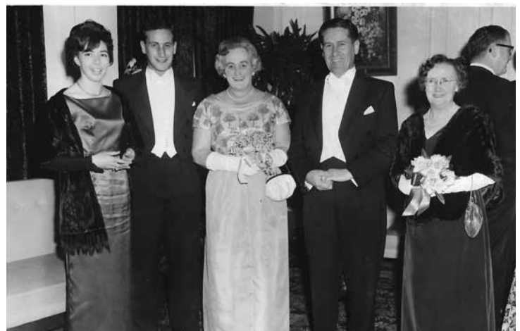
City of Malvern Mayoral Ball 1965