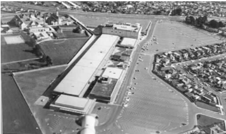
Aerial view of Chadstone Shopping Centre c1960 MP1077

Chadstone, The Fashion Capital, as it is now known, encompasses some of Australia's best known fashion and lifestyle stores, including two department stores (David Jones and Myer) and almost 400 retail outlets. Stylish shopfronts, luxurious fixtures, the famous galleria and a unique collection of Australian sculptures are all features of Chadstone's décor. It also has a state-of-the-art entertainment precinct and another area for the local shoppers called "Chadstone Corner" which caters for their everyday needs.