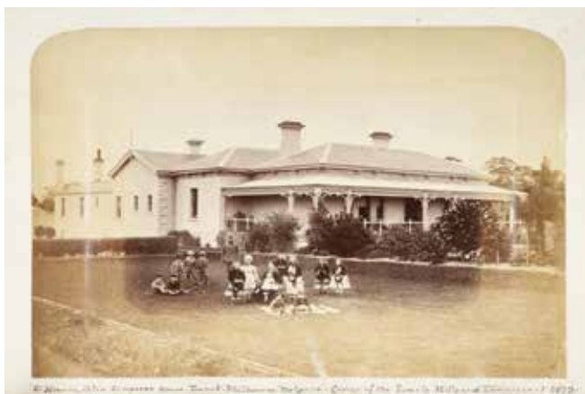
St Monans Williams Road South Yarra 1873