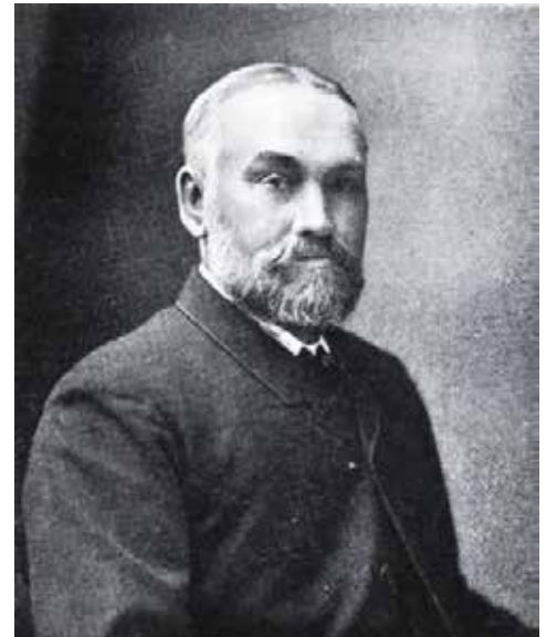
The Pastoralist Review 15 March 1905