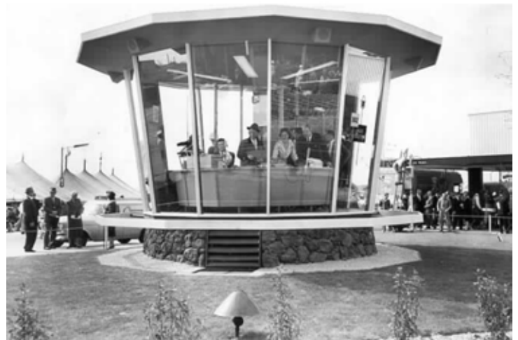
3UZ Radio Station at Chadstone Shopping Centre 1960