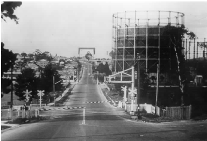
Toorak Road, looking east at Tooronga c1970