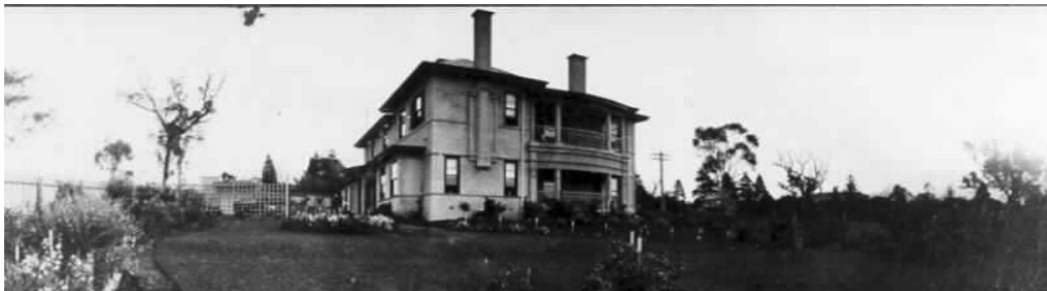
Above: Wildfell, 614 Toorak Road Toorak 1920 Stonnington History Collection MP8394