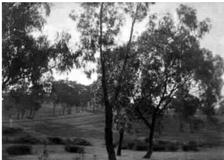
Ferncroft Avenue and Wattletree Road junction in centre of picture, 1912.