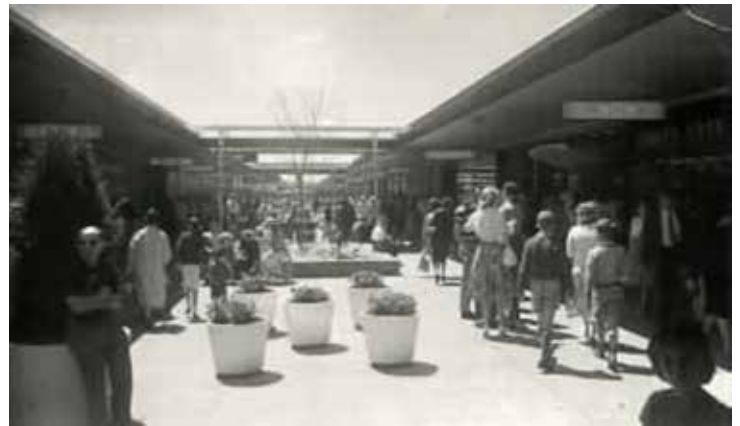
The Mall, Chadstone Shopping Centre c1960 Stonnington History Collection MP825