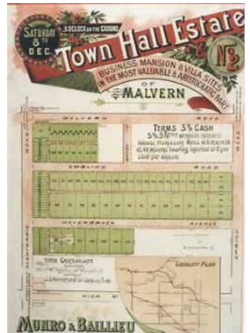
Town Hall Estate 1890 Stonnington History Collection MP5456