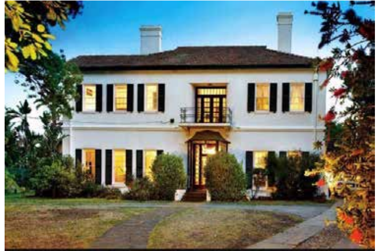
6 Haverbrack Avenue Malvern 2008