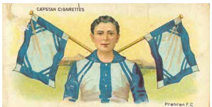
Prahran football card (undated)