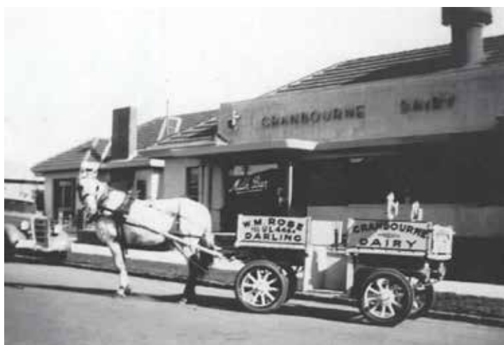
Above: Cranbourne Dairy, Darling Road East Malvern 1937 Stonnington History Collection MP5083