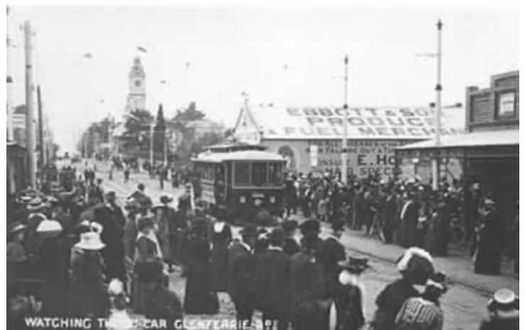
Watching the first car - Glenferrie Road looking north 30 May 1910 Stonnington History Collection MP1247

A new tram pole has been erected in front of 230 Glenferrie Road Malvern to replace an early pole that can still be seen nearby. The old pole may be the oldest tram pole still remaining from 1910 when the first electric trams left the Malvern Depot. Other than some later additions above the shop verandah, the pole itself is still in its original form retaining all its decorative rings and decorative top. It's not known if it's in its original position, it may have started its life as one of the poles in the middle of Glenferrie Road. An insulator can still be seen on the pole. Original tram poles can be seen in the 1910 image showing Glenferrie Road looking north from just south of Valetta Street opposite the entry to the Malvern Tram Depot. The fate of the early pole is still to be decided.