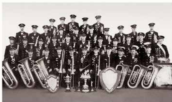
Malvern Tramways Band 1924. Price 1/-