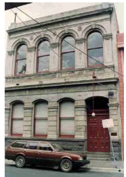
8 Cecil Place, Prahran c1983 Stonnington History Collection PH10265