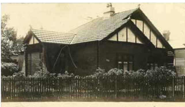
145 Dandenong Road Malvern (undated)