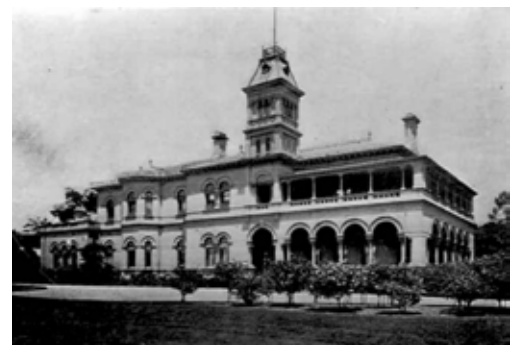
Myoora Toorak c1904 PH7841`

They later lived at Airlie , Domain Road, South Yarra.