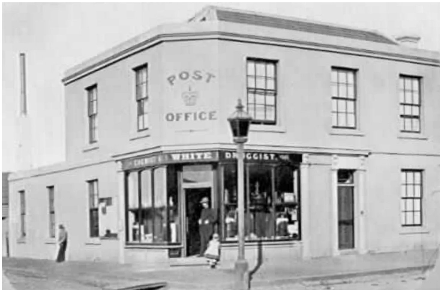
White's post office and chemist's shop, Chapel Street Prahran c1860 Stonnington History Collection PH8649