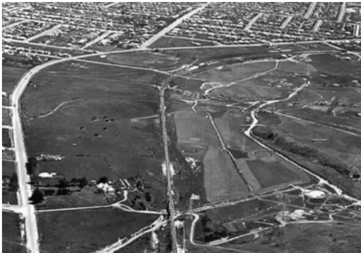
Glen Waverley Railway line 1930 Stonnington History Collection MP16

The early railway between East Malvern and Glen Waverley was only a single track. Passengers from the city had to change trains at East Malvern and catch a single carriage train. Subsequently it was referred to as the Flying Matchbox and it consisted of a first-class and a second-class compartment. In 1930 the power for the line came from Hughesdale on the Gippsland line and was conveyed along overhead wiring on wooden poles along the land previously used for the Outer Circle Railway (now the site of Stonnington's Urban Forest).