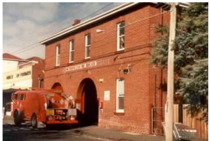
Fire Station, Willis Street Malvern 1988 MP7307

New members welcome! http://www.fps.org.au