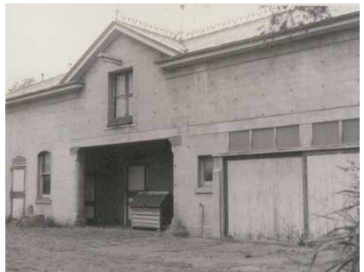
Nareeb stables c1960s

This Rolls Royce, known as Nareeb , was the Simmons family car. It was only ever driven by the chauffeur who also doubled as the estate's gardener.