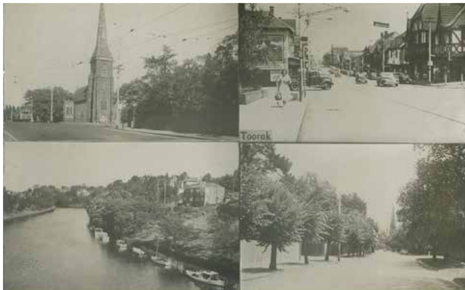
Toorak postcard (undated)