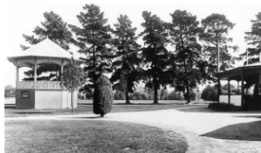
Bandstand, Central Park, Malvern East c1923