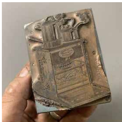
Letterpress printing image - W. Jennings Prahran metal c1885

Letterpress printing is the art of printing from a raised surface such as type or blocks. The pieces of metal cast with an image in relief on the upper surface are known as type, while a block is an illustration or drawing that has been engraved on a thin metal plate and mounted on a wood or metal base to match the height of type. A block can also be an engraving directly on a wood block. A configuration of lines or pages of type and/or illustrative matter imposed and locked up in a chase and ready for printing is called a forme. When a forme has been locked into its chase it is ready for printing. The chase is placed on the bed of the printing press and the forme is inked, by hand or mechanical means. A sheet of paper is fed into the press and a platen or cylinder impresses the inked forme onto the paper. https://collections.museumvictoria.com.au/articles/1323