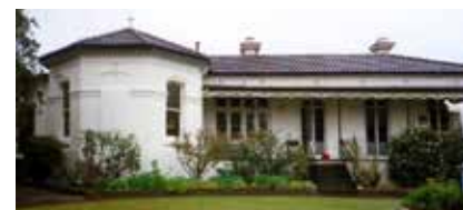
Highfield, Burke Road Glen Iris 1991 Stonnington History Collection MP11420

Members: Gold coin Non members: $5 All welcome!