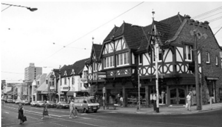
Toorak Village c1985 PH13908

All sculpture submissions must be original, and made in Australia within last 2 years. The 2020 exhibition starts on 1 May.