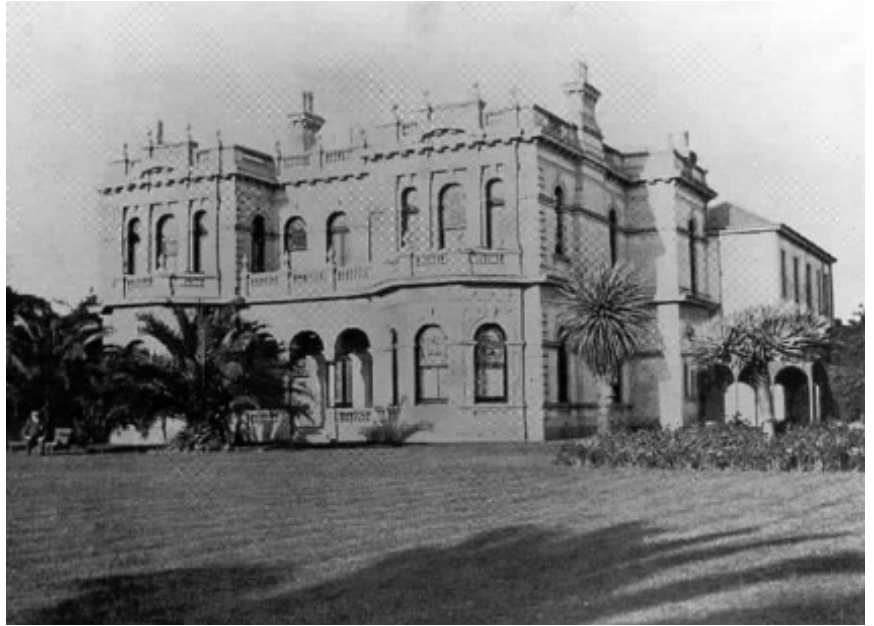
Nareeb (Oma)