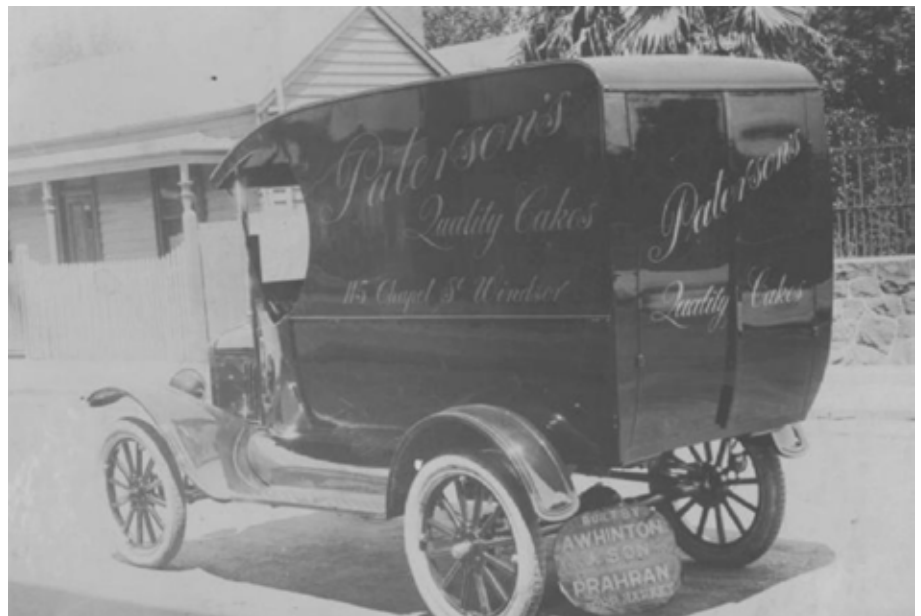
Paterson's Quality Cakes delivery van c1920