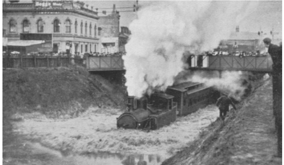
Flood waters South Yarra 1907 Stonnington History Collection PH491