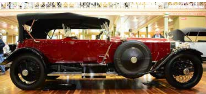
1920 Rolls Royce Silver Ghost Tourer