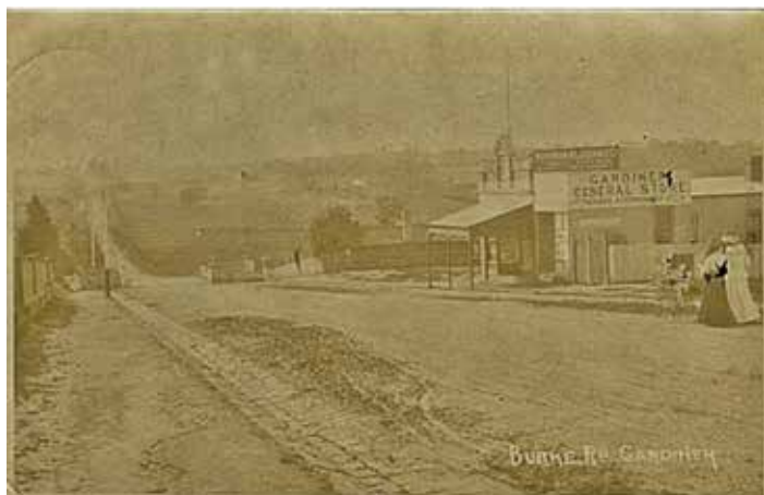
Burke Road, Gardiner c1890

By April 16, the Shire of Gardiner members had "made up their minds that the works as being carried out would inflict serious injury on some of the ratepayers". In their opinion, the work called for the construction of an