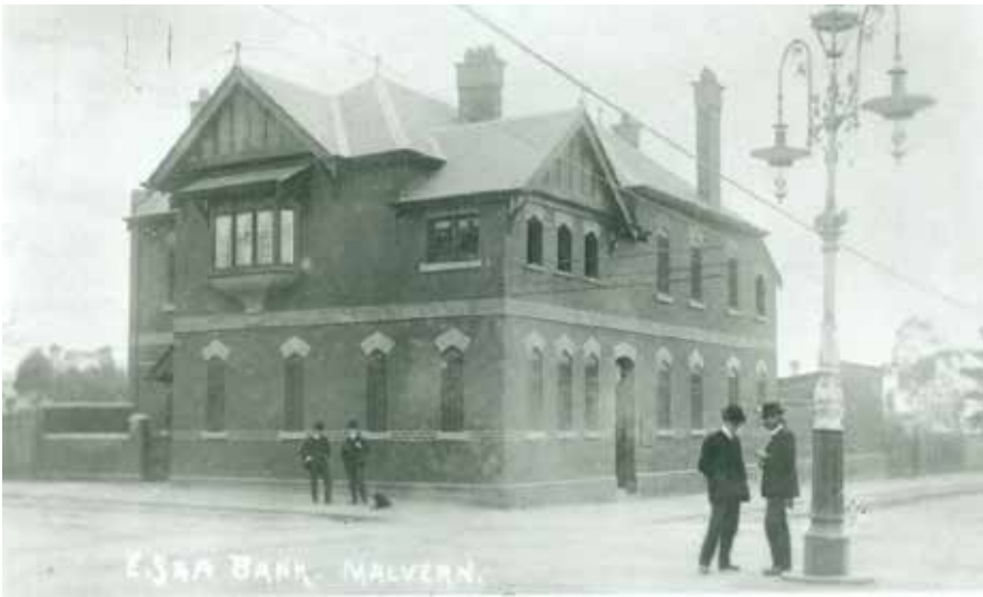
E. S. & A. Bank, Malvern 1907