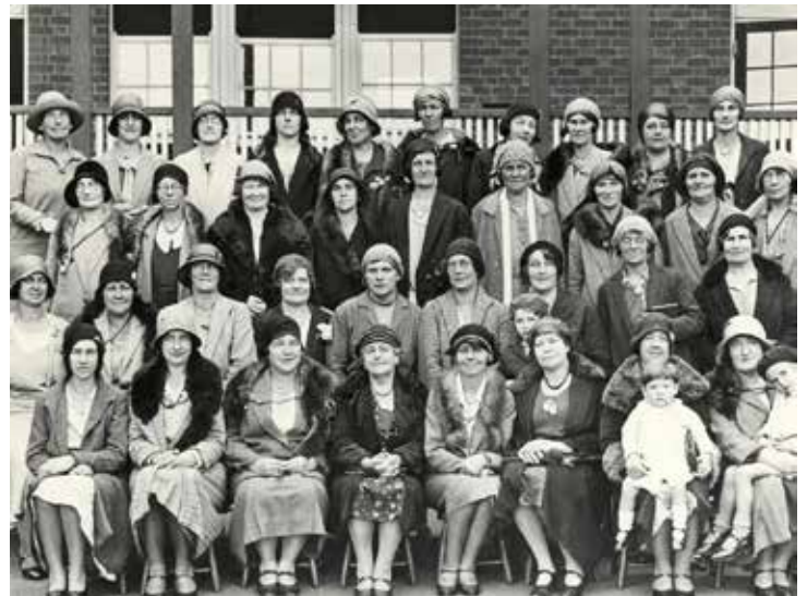
East Malvern Central School Mothers' Club 1931 Stonnington History Collection MP7393