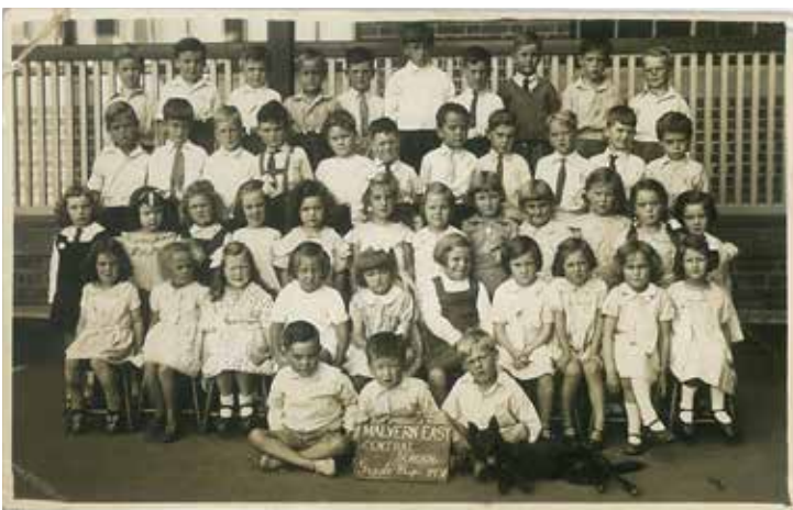
East Malvern Central School Prep 1936 postcard