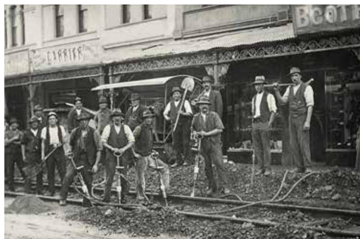
Laying of tram tracks Glenferrie Road Malvern 1910 Stonnington History Collection MP12032