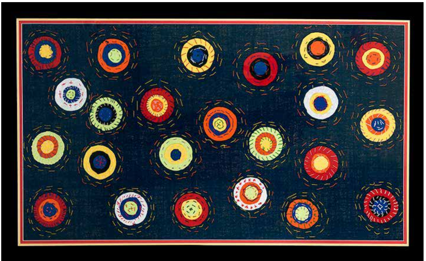
'Reconciliation' Holy Eucharist Primary School c2010