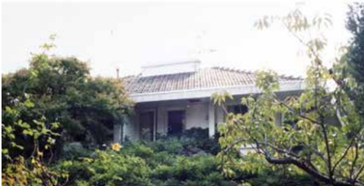
Revell, 9 Toorak Avenue Toorak 1992