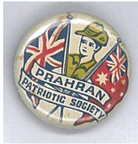
Prahran Patriotic Society badge.

Thanks Di and a special thank you to members who add donations to their subscriptions which allows us to make these valuable purchases.