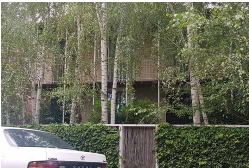
3 Buddle Drive Toorak

The Brett House is situated on a flat block on a short cul-de-sac in Toorak. It is a compact, two storey home constructed of light-grey concrete brick. The house faces west and looks over the Yarra River. It is symmetrically composed and built to a rectangular plan with a balcony and extended eave to the front elevation. It has four regularly spaced openings on each level of the street facing elevation, framed by narrow columns. The ground floor interior includes a lounge room, kitchen, dining room and bathroom. The main ground floor rooms contain French doors which open on to garden areas. The kitchen contains original cupboards, countertops, door pulls and a roller blind. Bagged brickwork, painted white, features in the lounge room. A largely original timber stair and timber lined stairwell leads to the first floor. The first-