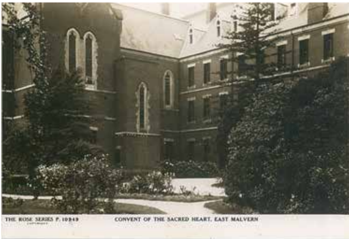
Convent of the Sacred Heart (Sacre Coeur) postcard