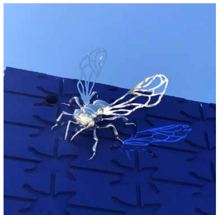
'murnalong' 2019

Prahran Square is the City of Stonnington's transformation of the old Cato Street car park in Prahran into an urban parkland above an underground car park. Recently three beautiful bees landed in Prahran Square, taking up residence at the top of the terrace. The work of Australian artist, Fiona Foley, 'murnalong' celebrates bees for their significance in our global ecosystem. Its title 'murnalong' is a local indigenous Boon Wurrung word, meaning bee.