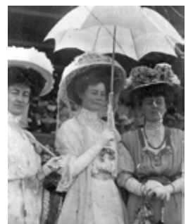
Power family members c1900