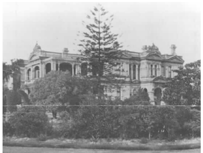
Moorakyne 1932