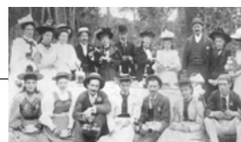
Local picnic c1900 Stonnington History Collection MP2624

Mark your diaries! The 4th annual East Malvern Food & Wine Festival will be held in picturesque Central Park, corner of Burke Road and Wattletree Road East Malvern. Enjoy a selection of local and regional culinary exhibitors.