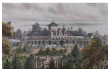
Wynnstay 1888