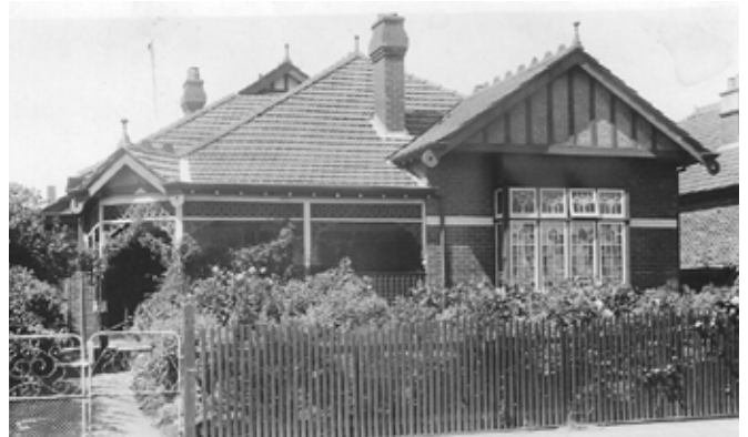
Coree , 66 Tooronga Road Malvern