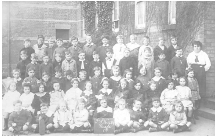
Hawksburn state school Grade 1 c1900