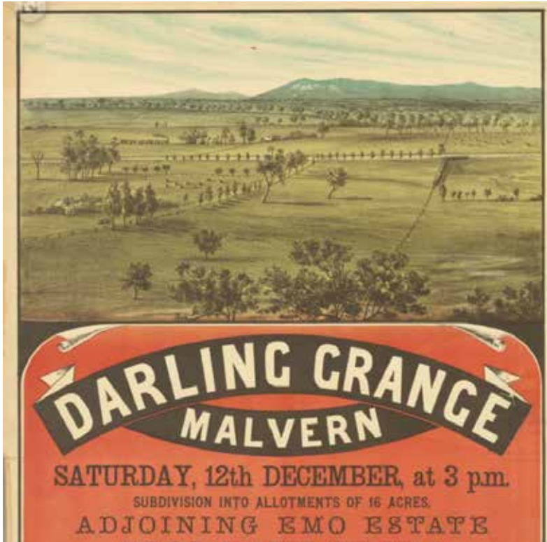
Darling Grange Malvern 1885 Stonnington History Collection MH61167

www.stonnington.vic.gov.au/Discover/History/Search-the-catalogue