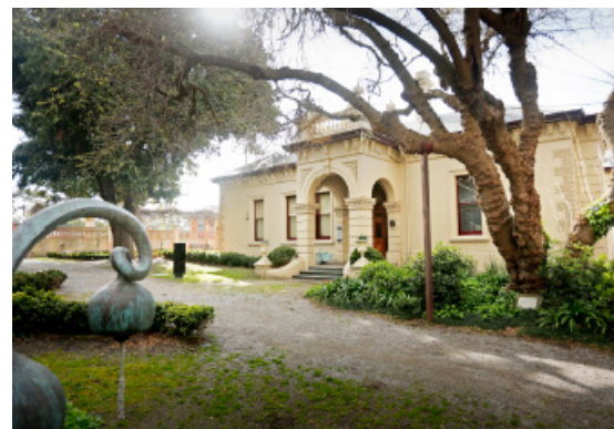
Northbrook 2015

The following buildings will be part of this special event: Central Park Conservatory, Malvern East; Como House and Garden, South Yarra; Former Malvern Fire Station now the Firestation Print Studio, Malvern; Former Prahran Police Station and Courthouse, Prahran; State Gymnastics Centre, Windsor; Malvern Town Hall, Malvern; Mandeville Hall , Toorak, Northbrook and former stables, Malvern; St George's Anglican Church, Malvern; St Joseph's Catholic Church, Malvern; Stonnington Depot, Malvern; The Gables , Malvern East; Toorak House - Swedish Church Melbourne, Toorak; Umina - The Country Women's Association of Victoria, Toorak; and Valentines - Malvern House, Glen Iris. Now in its 12th year, Open House Melbourne is the largest and longest-running Open House program in Australia. openhousemelbourne.org