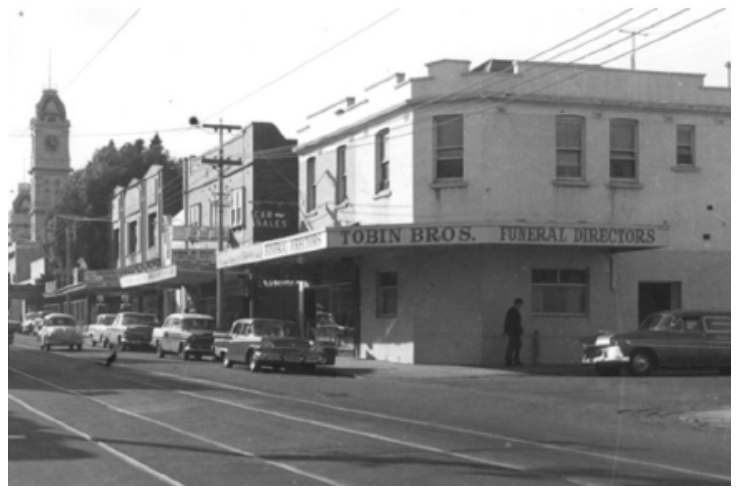
Tobin Brothers 248 Glenferrie Road Malvern