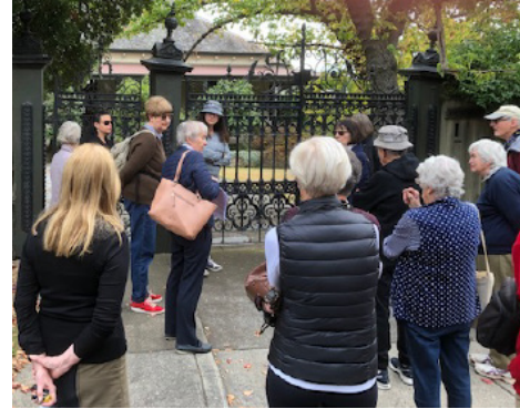
Heyington Station area walk 2019