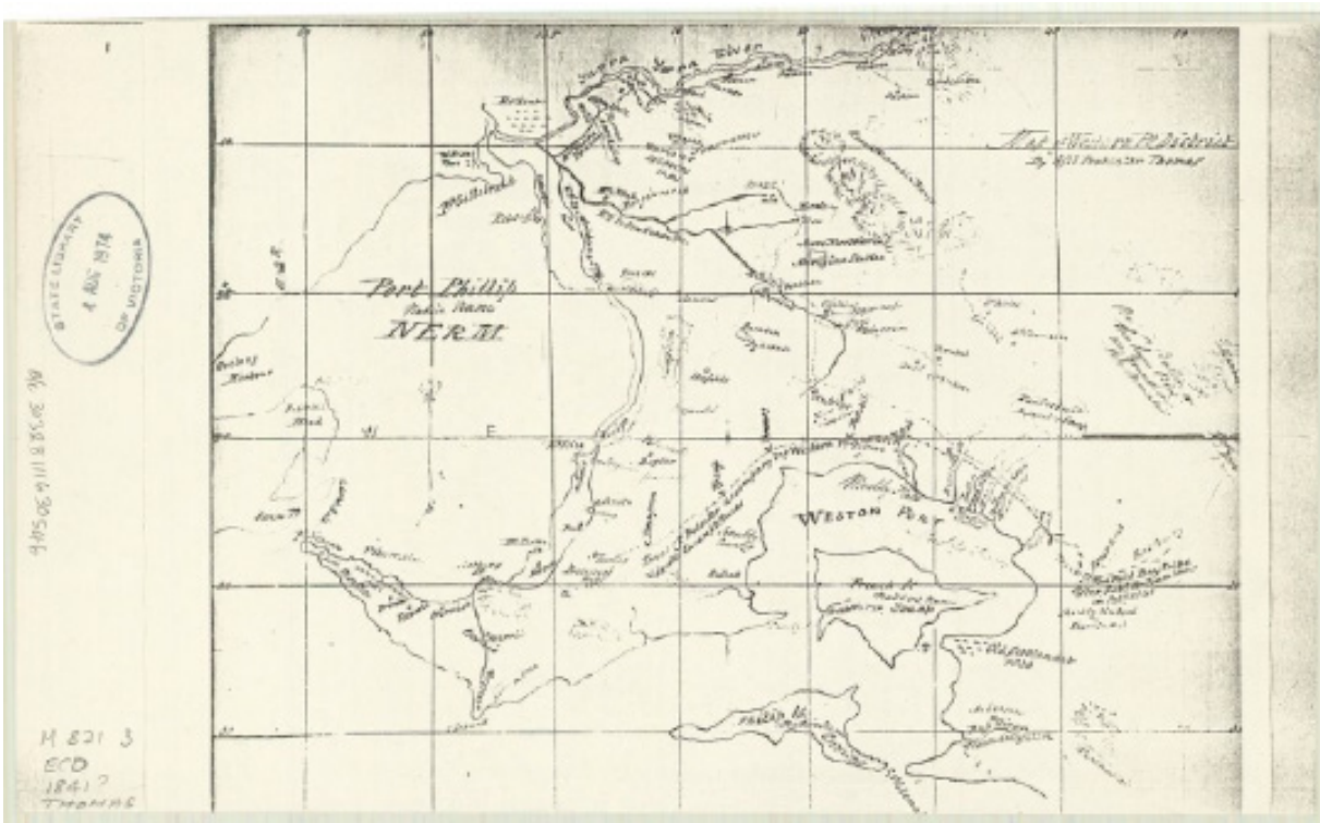
Map of Western Port District by Asst Protector (William) Thomas 1840. (SLV ma000704)