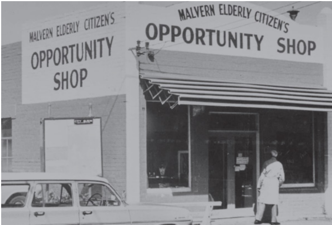
Malvern Op Shop 1964

mecwacare is an organisation founded by a group of volunteers concerned about the elderly and vulnerable in their local area and is a unique story of a community caring for itself.