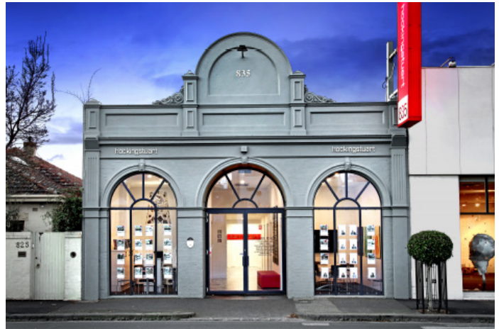
835 High Street Armadale 2019

The first four wheel Phaeton, wooden bodied steam car by Herbert Thomson, now in Museum Victoria, was originally constructed in 1896-99 and exhibited in Victoria and New South Wales. Thomson made steam engines including the vertical tandem compound engine and water tube boiler fitted to this vehicle, which was finished in about June 1898. This steam car was later exhibited as a historical curiosity by Vacuum Oil at the Victorian Motor Exhibition in 1912, the first Victorian motor trade show. It was then dismantled and restored in about 1960 before being donated to the Melbourne Museum.