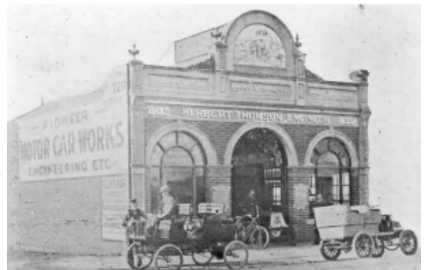
Thomson's Motor Works, High Street, Armadale c1906 Stonnington History Collection PH7372

The original Thomson engineering works building at 835 High Street Armadale was investigated as part of the City of Stonnington's Shops Heritage Study undertaken in 2011. It was identified in the preliminary investigation (Stage 1) and was recommended for further investigation. In Stage 2 of the Study it was looked at in more detail and found not to meet the threshold for individual significance. The Study concluded: 'The building has historical significance for its pioneering role in Australian automotive manufacturing, but it is of limited architectural significance. The significance of the place could be recognised through means other than retention of the building, such as the existing historical marker on the façade and archival recording, in the event that it is altered or demolished at some future point.' (2011) (2018). There is a City of Stonnington Heritage Marker on the building.