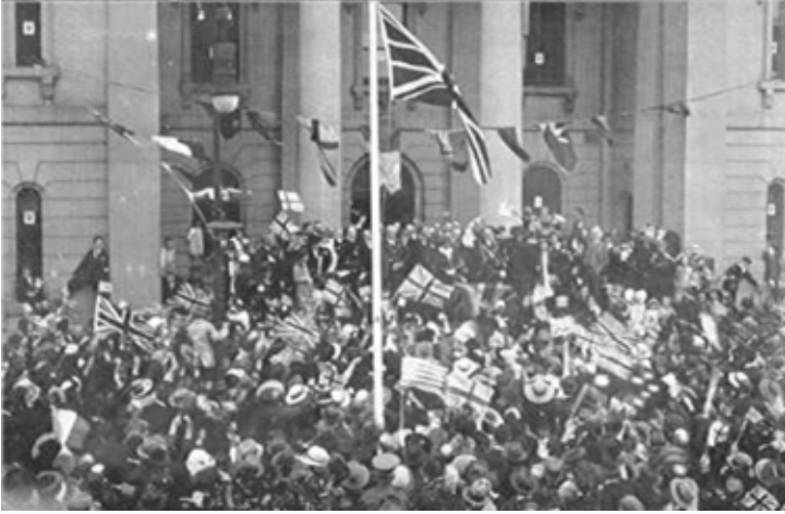
Cessation of Hostilities November 1918 Stonnington History Collection PH9210

With the signing of the peace treaty the school children of the City were entertained at film shows at the local cinemas, and a thanksgiving service was held in the City Hall. Prahran City Council Annual Report 1918/19.