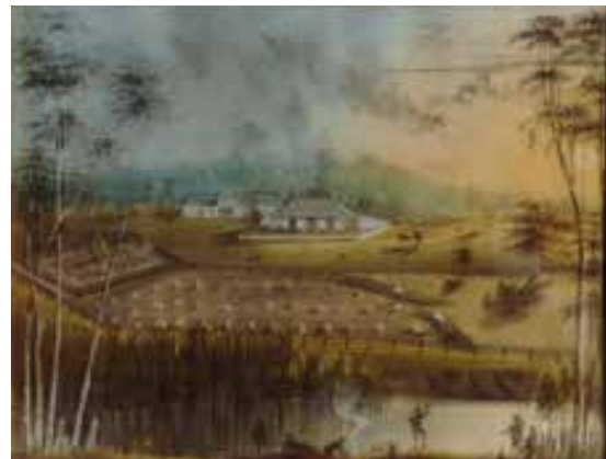
Glenferrie c1850s Stonnington History Collection MP8055