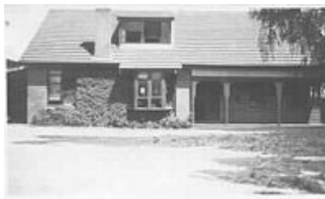
Aldworth Girls' Grammar School 1914, corner of Coppin and Clarence Streets East Malvern.