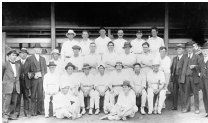
Malvern Cricket Club vs Buckeye Harvester Malvern c1915