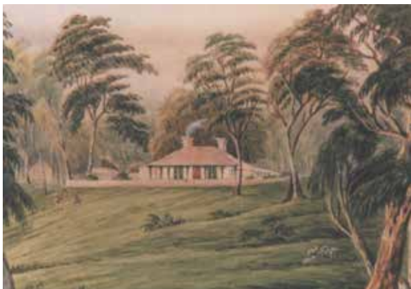
Glenferrie c1840s