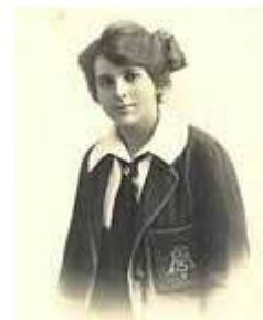
Aldworth Girls' Grammar School student. c1918