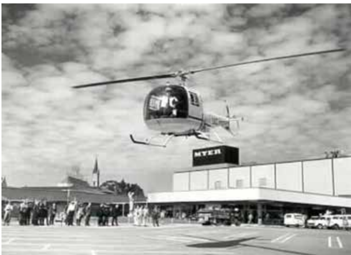
Ansett ANA 3UZ helicopter landing in the car park Chadstone Shopping Centre c1960