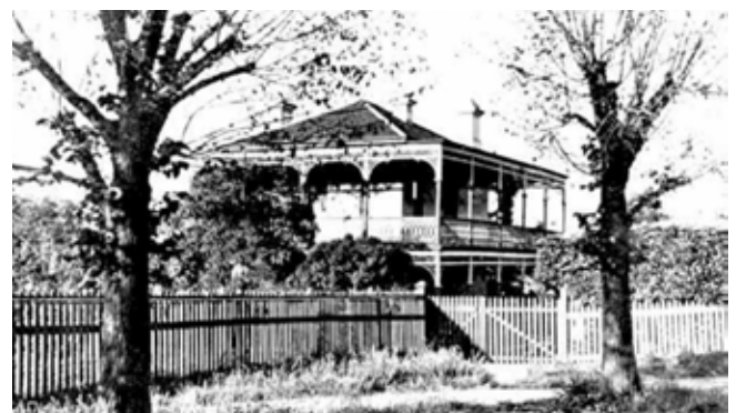
Heyington House (undated) PH2369