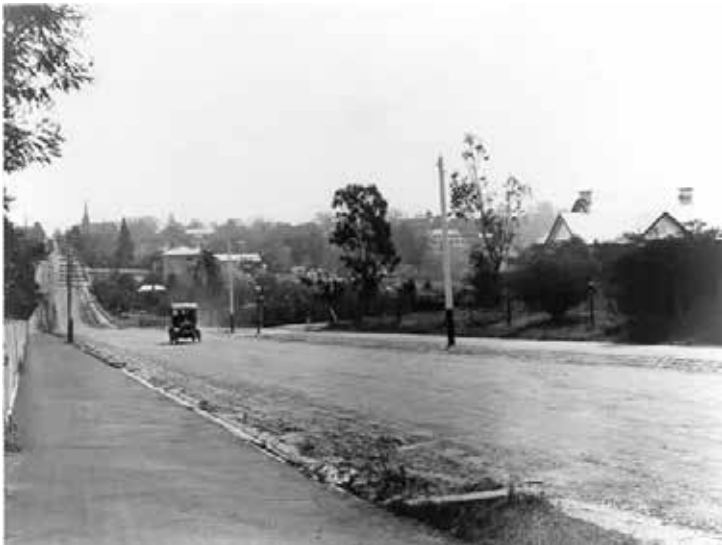
Toorak Road looking west from Glenferrie Road 1912 MP 8820

Toorak is said to derive from an aboriginal word meaning 'swamp with rushes'. Toorak House is possibly the oldest surviving mansion in Victoria. It was built for Melbourne merchant James Jackson between 1849 and 1850 on 148 acres (approx 60 hectares) of land, shortly before the discovery of gold in Victoria. In 1853, with Governor La Trobe's term of office about to expire, the search began for an appropriate official residence for the next Governor. Toorak House was leased and renovated as a temporary solution. Five Governors occupied Toorak House . It was to be twenty-one years before Government House was built in The Domain, South Yarra. Several long-term owners followed. In 1957 Toorak House was bought by the Swedish Church.