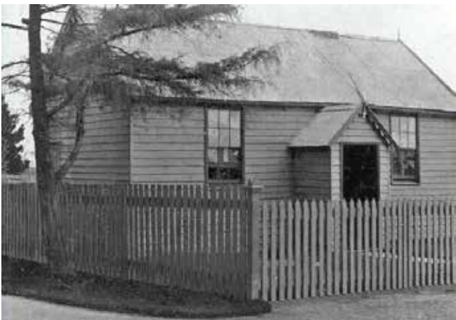
Old Original Church 1854 Stonnington History Collection MP949

A timber Parish Hall, capable of holding over 300 people, was erected in 1901. With the growing population, the congregation out-grew the old church. A scheme to enlarge the old building was abandoned and in 1919 tenders were accepted for the construction of a new church building. The foundation stone was laid by Archbishop Clark and the new church was opened for service on 2 November 1919. Liddiard Hall was named in memory of the first Minister, following the construction of the new and larger church building.