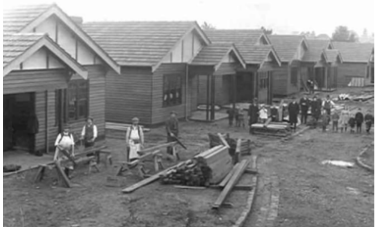
War Widows’ Homes c1919 Stonnington History Collection PH8556

Victory Square Reserve, Ashleigh Road Armadale (to the east of the Toorak Park sporting reserve in Orrong Road) is the former site of 16 timber houses built in 1919 to accommodate war widows and their children. Each house cost £500 to build. Funds were raised through public subscription. The houses were built in six months, with significant help from volunteers attending the working bees every Saturday morning. The houses were demolished in the early 1970s.