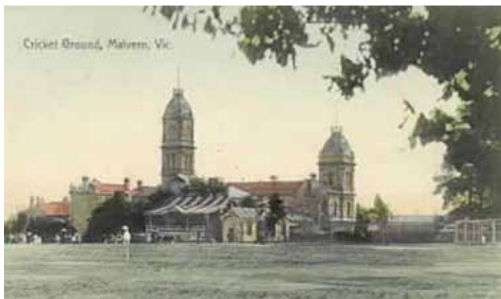
Cricket Ground Malvern 1907