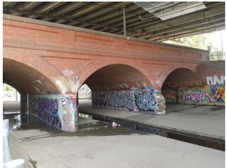
Gardiners Creek Bridge Glenferrie Road Kooyong 2019

http://vhd.heritagecouncil.vic.gov.au/places/195701/download-report