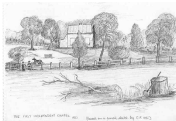
Pencil sketch of the first Independent Chapel in Chapel Street, based on a pencil sketch drawn in 1851. Betty Malone c1984 Stonnington History Collection PH10778