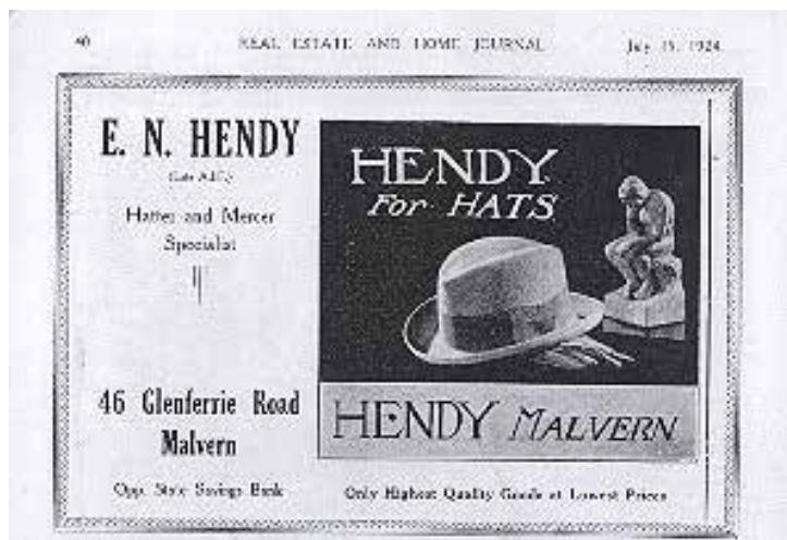
Hendy Hats advertisement July 1924