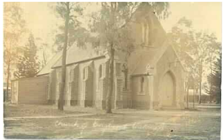
Church of England Oakleigh 1907 Stonnington History Collection MP622