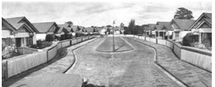
Victory Square, Armadale c1940 Stonnington History Collection PH9343